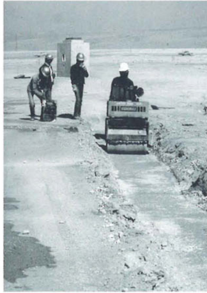
Utility ducts (left); a backfilled and compacted utility trench.