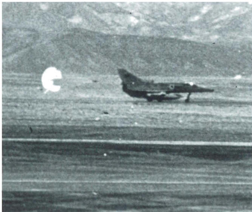
One of the first Israeli Air Force fighters to land at Onda.

would remember the quality of the work long after adherence to the schedule was forgotten. With this in mind, he insisted that the system for quality verification had to work well. To make sure that it did, he relied heavily on the project engineers. The area office construction branches were the focal points for this effort. The managers of the support contractor's quality assurance teams at the sites reported to the respective chiefs of the construction branches, rather than to their own parent organization. Also within the construction branch, project engineers oversaw specific work items or facilities, ascertaining the adequacy of procurement and making sure that schedules were met as well as ensuring quality. Completely responsible for coordination of design, purchasing, and construction for their facilities, they monitored and reviewed progress daily until final acceptance by the user. 47