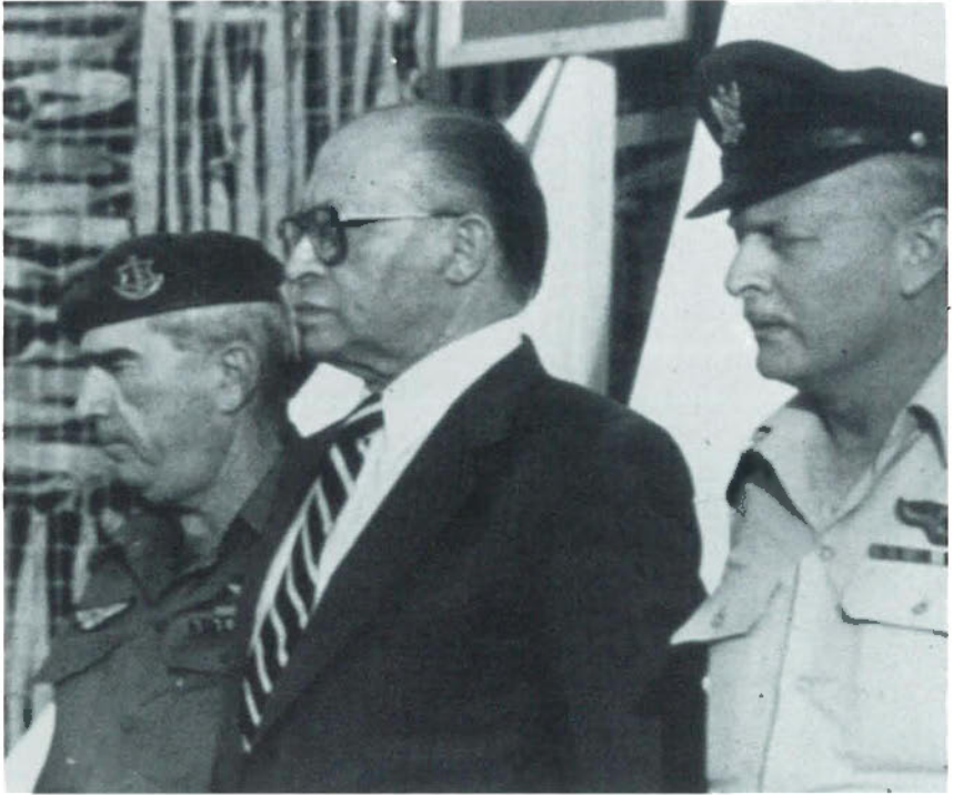
Prime Minister Begin at the formal opening of Ovdá Air Base in October 1981, flanked by the Israeli Defense Force's Chief of Staff, General Rafael Eitam (on Begin's right), and the commander of the Israeli Air Force, Maj. Gen. David Ivry.

first time in the project that we have a good tool by which to manage the cost-plus contract." 49