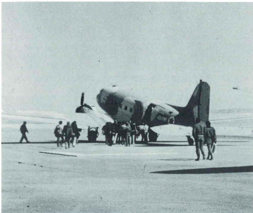
Reporters boarding an Israeli Air Force C-47 for the daily shuttle between the sites and Tel Aviv.