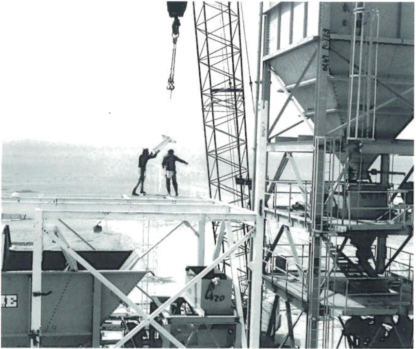
Bulk cement storage facility under construction at Onda in the spring of 1980.

The engineering division decided to use spread footings, set into bedrock where possible, and elsewhere on structural fill. 70