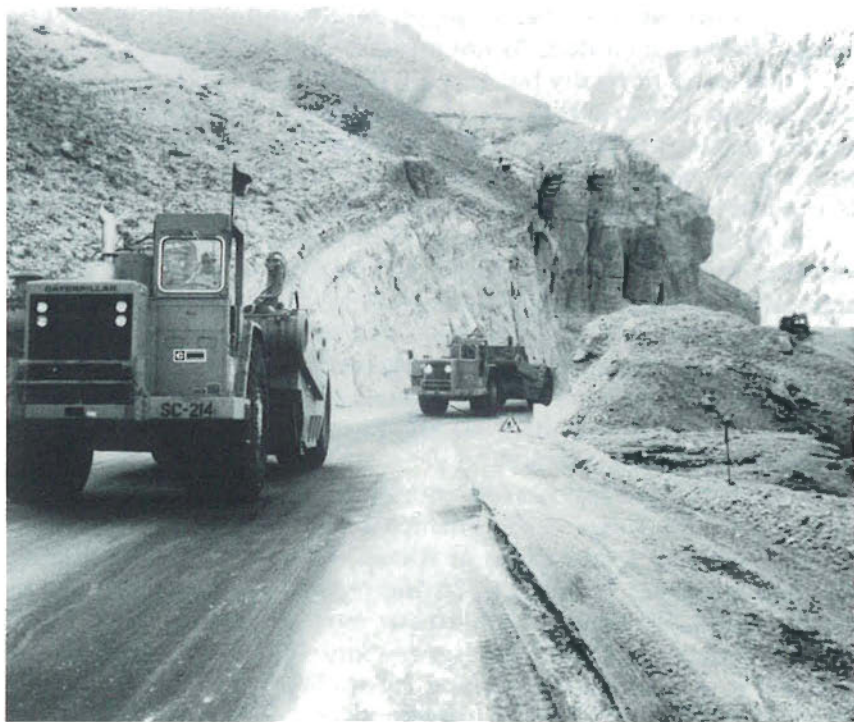
Ramon access road

wells. The constructors also installed 25,000-cubic-meter storage ponds that were lined and covered with plastic. At Ovda, providing a consistent supply for the work force proved early to be a significant problem. Before the purification plant began operation at the end of October, shortages were "severe and inexcusable," according to Curl. In later months occasional breakdowns at the plant required management to issue bottled water for drinking and to pipe brackish water to the billets for sanitary use. 60