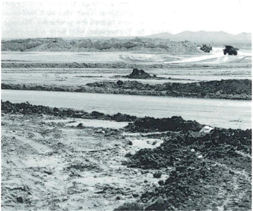
Excavation of Glide Path Hill at Ramon