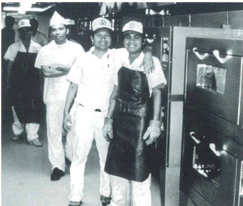
Thai kitchen workers at Ovda