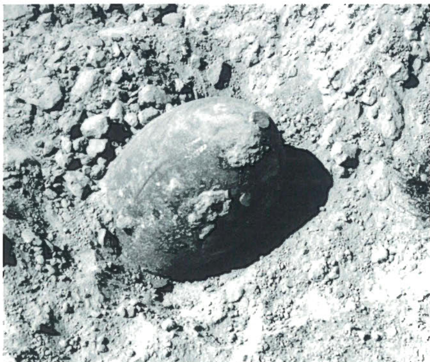
Nose of a 750-pound bomb exposed at one of the sites during the clearance of unexploded ordnance.

an explosion at the same time that an aircraft comes over. We may get their attention.” 29