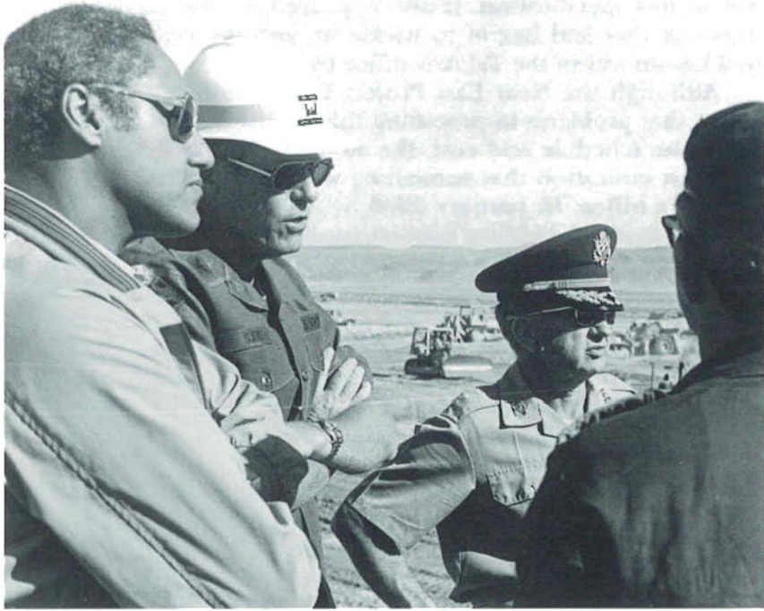
Secretary of the Army Clifford Alexander confers with Colonel Curl and Colonel Gilkey at Ouda.

plex networks of reinforcing steel. In the shelters and other hardened buildings, Israeli design tended to call for smaller bars than those the Americans normally used. The Israelis bent a great number of the small bars by hand into a tight mesh over which they placed concrete. The completed wall resembled glass-encased chicken wire. Like other aspects of Israeli design that tended to be labor intensive, this method reflected the relatively low wages of workers compared to the cost of machines in Israel. Americans, on the other hand, usually faced higher wage and benefit costs. So they used fewer and larger rods, which they bent by machine. 4