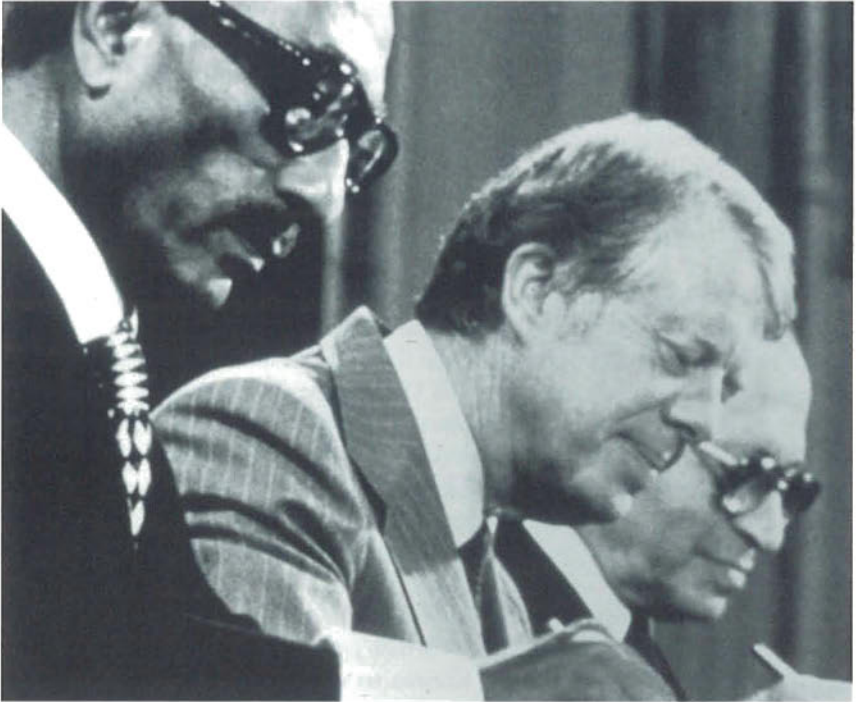
Camp David accords. President Sadat, President Carter, and Prime Minister Begin signing the agreement.

through the Suez Canal for Israeli ships. This document became the basis for the treaty signed in Washington on 26 March 1979. The other agreement concerned a general regional peace. The "Framework for Peace in the Middle East" expressed the interests of both nations in "a just, comprehensive, and durable settlement of the Middle East conflict." It also left the issues of Palestinian rights and the Israeli occupation of the West Bank, Gaza, and the Golan Heights open for negotiations. 38 With none of the key issues regarding the Palestinians and the territories decided, the overall agreement was extremely ambiguous. So the Camp David outcome amounted to a separate peace between Israel and Egypt, a result that did not get to the crux of the regional problem and that had not been sought by the United States or Egypt. 39