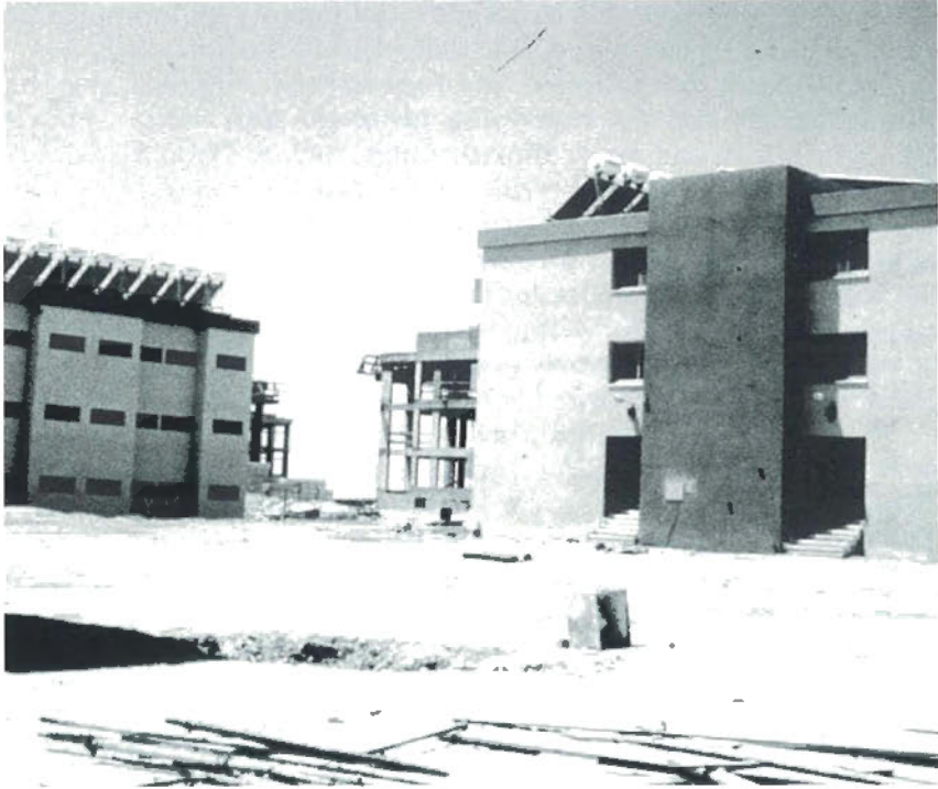
Airmen's dormitories, with solar panels on rooftops, at Ouda.

system put the lion's share of the management burden on Negev Airbase Constructors; the contractor's field facility coordinator became responsible for meeting turnover dates. In doing so, he integrated the procurement and construction schedules and each week updated the exception report on the facility. The contractor also appointed an activation interface coordinator who kept a ninety-day activation schedule and prepared weekly reports on activation and deficiencies for a Corps employee with a similar title. The system was completed with a wrap-up crew. This group of workers from several disciplines eliminated all known deficiencies that they could correct with equipment and materials on hand. 35