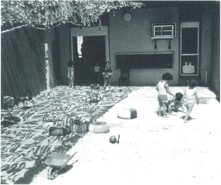
Family housing, complete with camouflage netting, at Ovda.

Mongolian goat grab." The transfer of the ammunition storage area simply "bombed out," according to Griffis. The Americans in the regional civil engineer organization wanted to turn over the entire area at once; the Israelis objected because of pavement flaws in one portion. Problems also appeared at Ovda during turnover of parts of the radio transmitter and receiver work package because of a seven-page list of deficiencies, many of them trivial or irrelevant. Worse yet, Wall found out about the embarrassing situation from Hartung rather than from the area office. 34