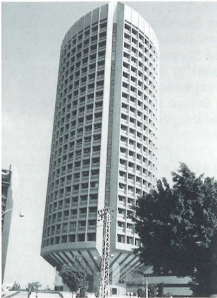
IBM Building in Tel Aviv