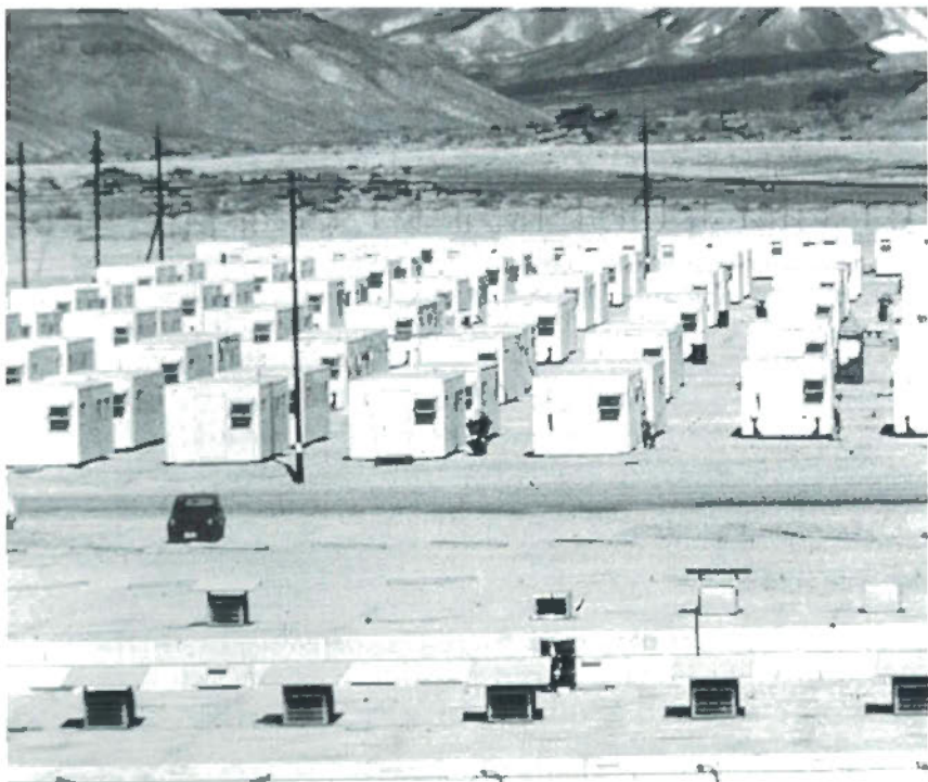
Management camp at Ouda