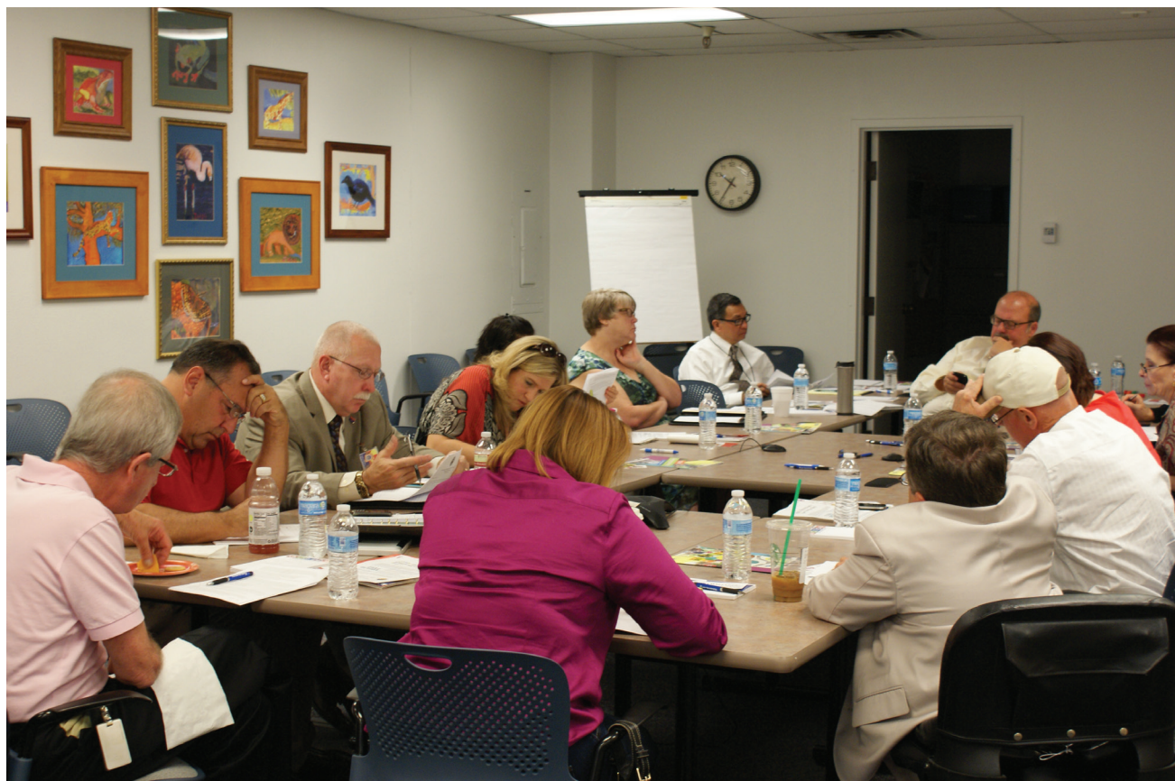
April 11th Focus Group: Increasing the inclusion of persons with disabilities in state volunteer programs.

that volunteering involving youth and adults, especially when related to service that can build job skills, is an important option leading to employment. Bob's office has several tools that can be used to support volunteerism, with one standing out as a great resource. The AmeriCorps program managed by the GCSV in Arizona, is a federally funded project which offers a variety of opportunities throughout the state and can lead to people finding jobs. AmeriCorps is unique in that it also offers a paid stipend to offset expenses of participants,