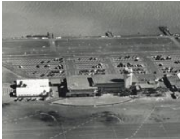
Below: Two aerial views of the HNL terminal buildings in 1947.