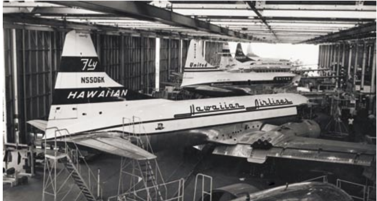
Above: Multiple airlines share a hanger in the 50s.

FY 1957-58 Aircraft operations at Honolulu totaled 279,515 takeoffs and landings for an increase of 14.1 percent over the preceding fiscal year.