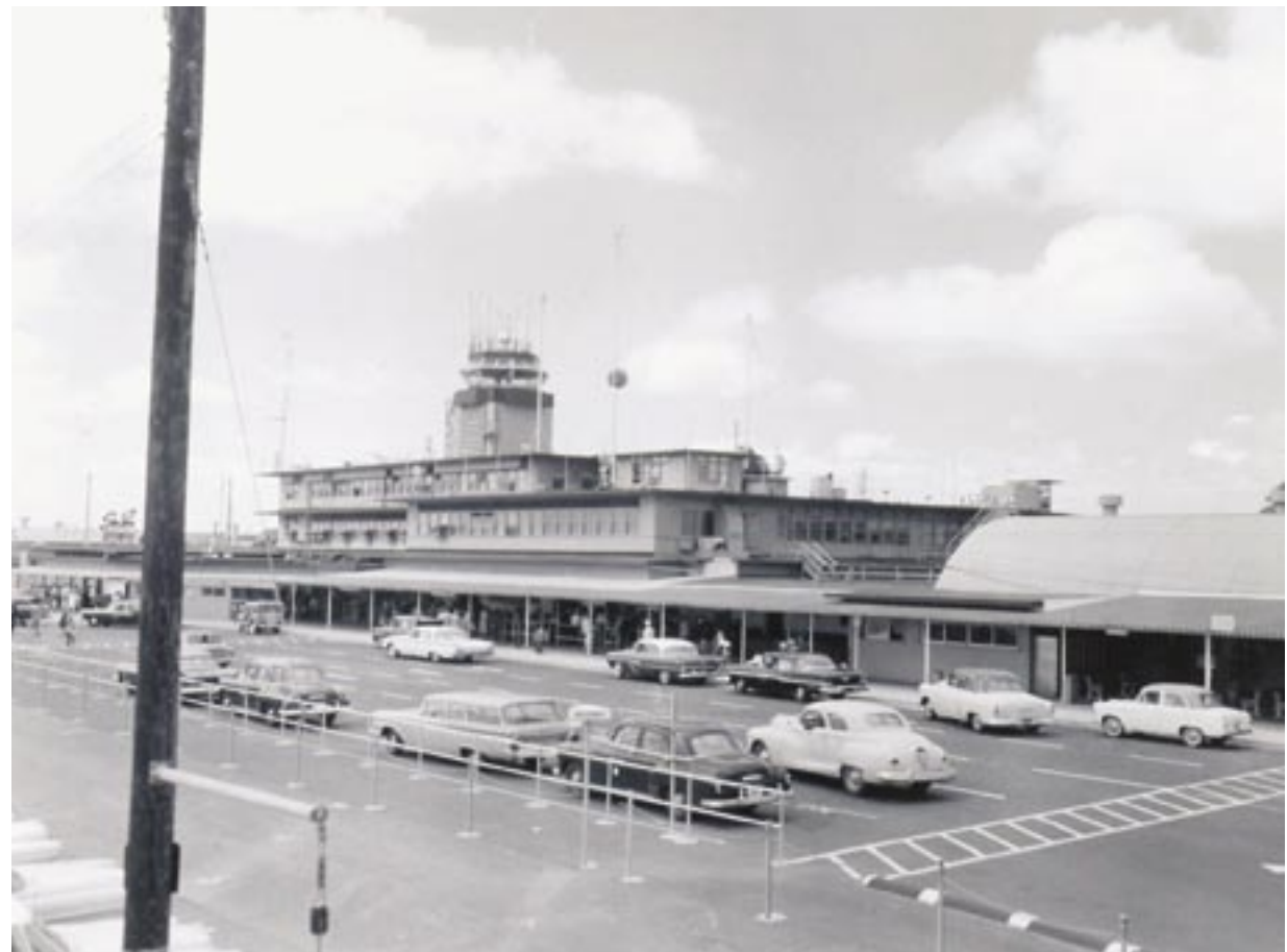
Below: Street side of Honolulu Airport c1950.

Some of the thriving businesses now in the area included hotels, apartments, warehouses, manufacturing, restaurants, grocery stores, meat packing plants, an egg cooperative, a theater, woodcraft shops and a college. In addition, playground and recreation hall facilities have been provided for families living in this section. The resident population numbered more than 900.