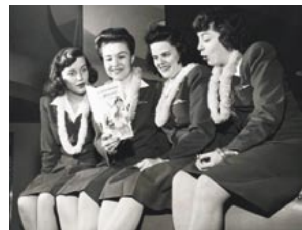
Top: United Airlines Poster. Above: United flight attendants.