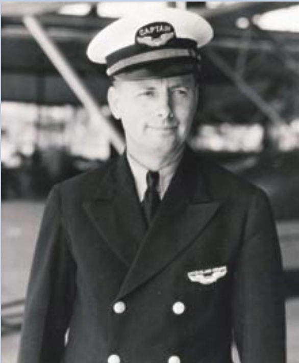
Top: Commander John Rodgers was honored with leis and ceremonies after the first trans-Pacific flight from the Mainland to Hawaii on August 31, 1925.