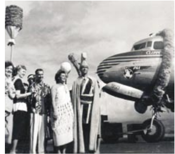
Above: Pan Am Clipper is draped with a lei during Aloha Week Ceremony.

The fall and winter of the fiscal year saw the beginning of Stratocruiser service between the West Coast and Hawaii by United Airlines, Inc. and Northwest Airlines, Inc.