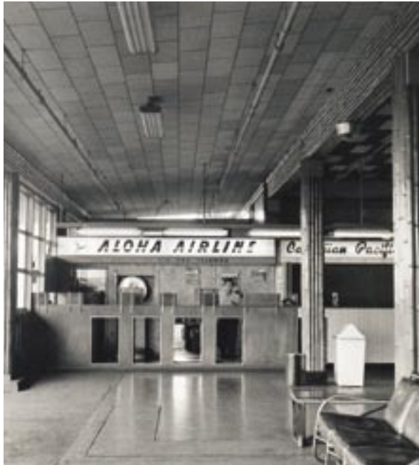
Above: Aloha Airlines ticket lobby.

The terminal site plan provided space for other facilities, such as cargo and freight buildings, aircraft servicing and maintenance areas, aeronautical school, automobile service station, auto parking area for 4,200 cars, lei stands, and a heliport.