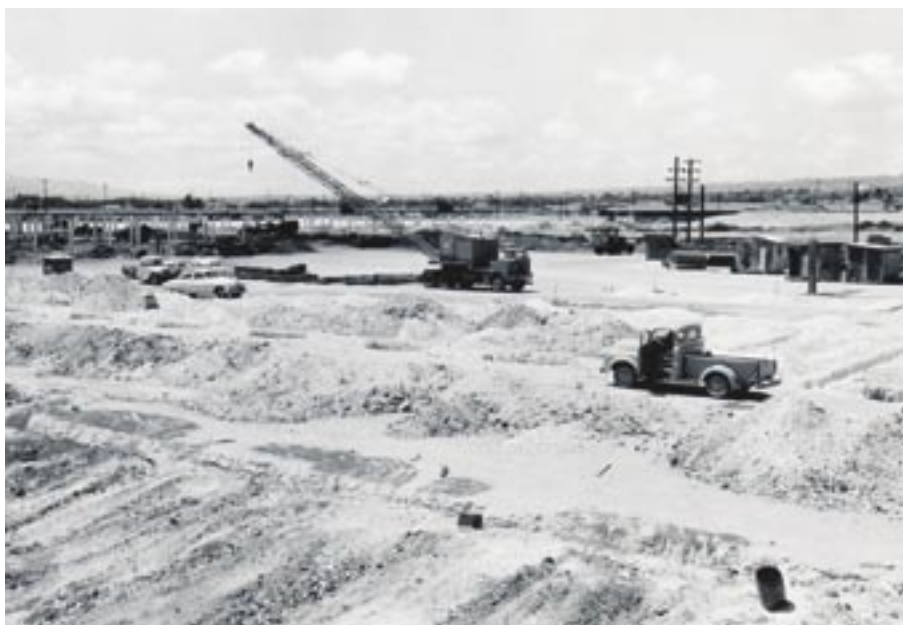
Opposite top: Hawaiian Air planes line the gates to load passengers. Opposite bottom: A plane is towed into the hangar. Below left: Construction begins for the new jet-age airport terminal. Below right: Pan American celebrated its 50,000th flight on April 29, 1959.

There was a sharp rise in foreign arrivals, both by commercial and military charter airlines. This resulted in a slow