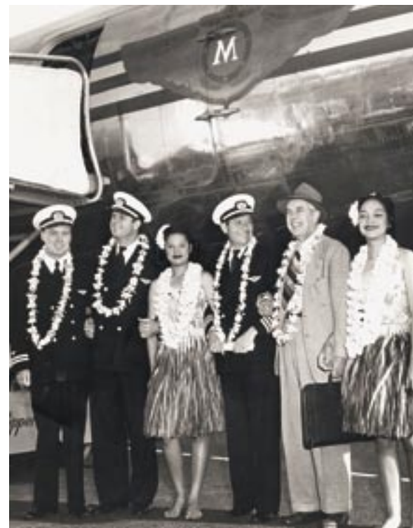
Top: Honolulu Airport after it was returned to the Territory following World War II.