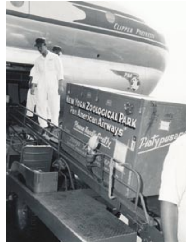
Above: A "Platypusary" travels by Pan American Clipper.

March 1945 One Hawaiian Airlines C-53 Douglas aircraft was converted to augment the Sikorsky freighters then in use by the airline.