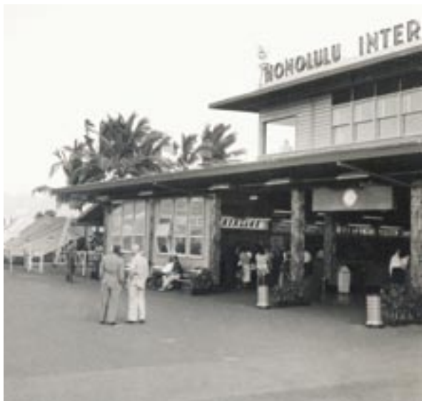
Top: HNL's 13,097 foot runway was officially declared the longest runway in the world by the Airport Operators Council in 1953.

June 1954 Airport zoning regulations, developed to prevent creation of airport hazards, took effect.