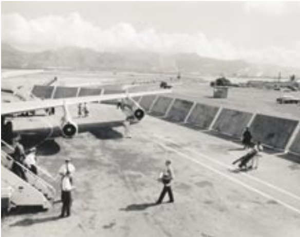
Below: A blast fence typical of the 1950s. Bottom: Cargo is loaded aboard a Hawaiian Airlines plane.