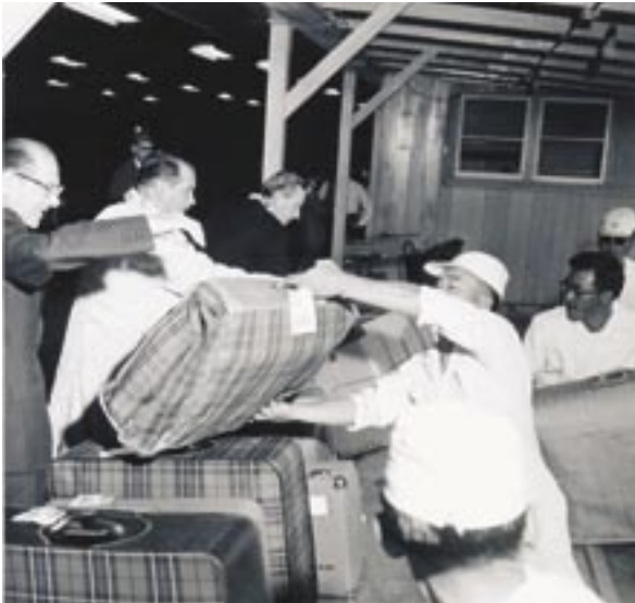
Below: Curbside baggage handling. Bottom: G.I.s go through U.S. Customs.

May 1951 Joint Resolution 13, Session Laws of Hawaii 1951, was signed by the Governor. One of its provisions