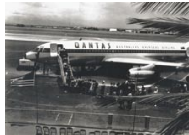
Top: United Airlines celebrated the start of its DC-8 jet service. Above: Honolulu was a stop on Qantas' around the world flight in 1959.