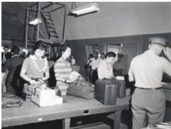
Above: Foreign arrivals.

was discontinued. Transportation of airport and airline employees without private transportation became critical; and to encourage drivers to offer rides, waiting shelters were placed at the highway intersection and near the Overseas Terminal as protection in rainy weather and to discourage walking along the highway.