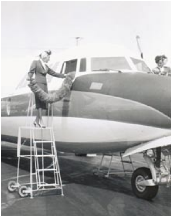
Above: Aloha Airlines first F-27 arrives in 1961.