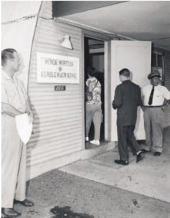
Above: U.S. Public Health Service, c1950.

Opposite: Passengers and well wishers crowd the gates as Pan American and United passengers are ready to depart.