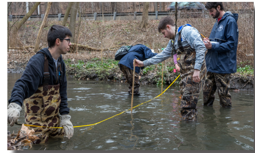
Pictured above: Tibbetts Brook Watershed Crew conducting weekly monitoring.