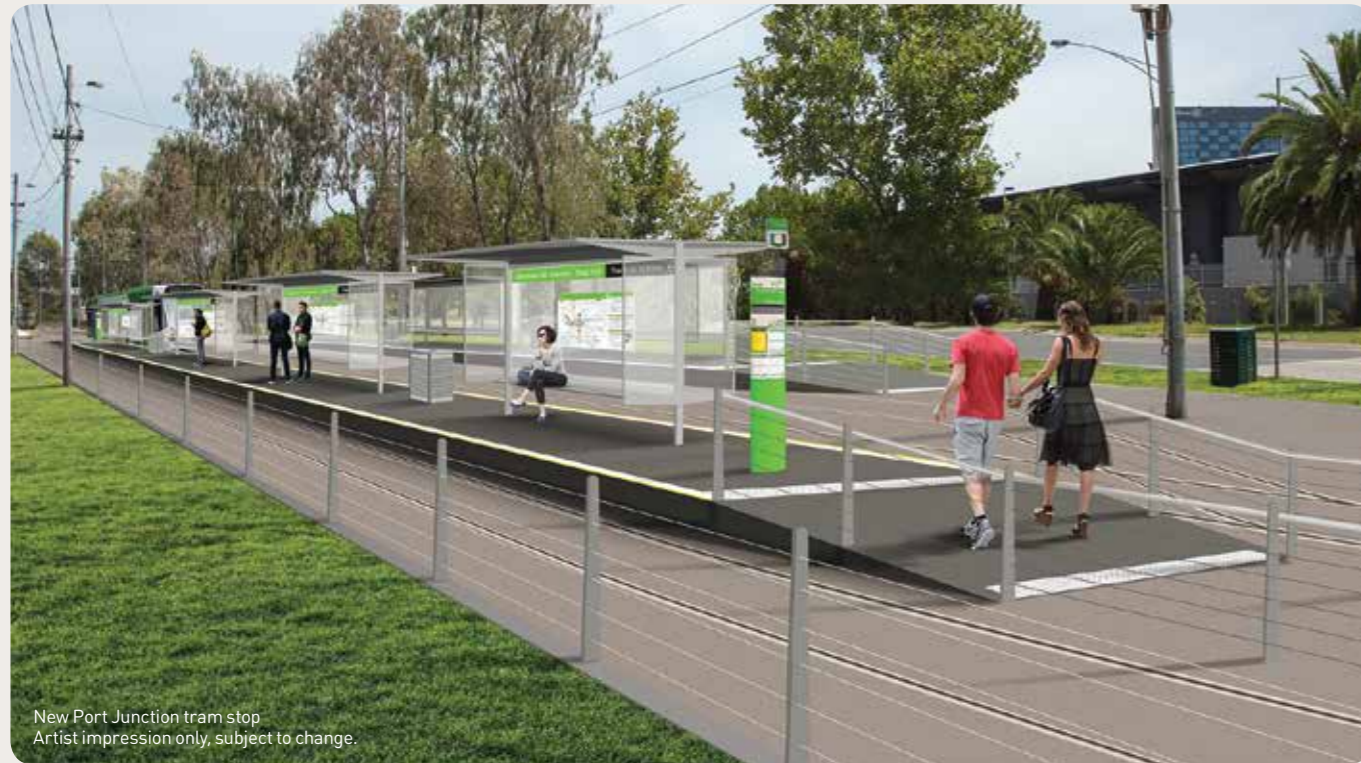
New Port Junction tram stop Artist impression only, subject to change.

Furthermore when the new level access stop opens on Friday 15 January 2016, the stop will be renamed Stop 125, Clarendon Street Junction.