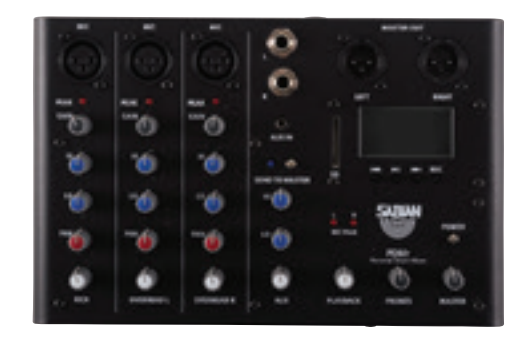
PDMr MIXER – DESIGNED FOR DRUMS with easy on-board recording