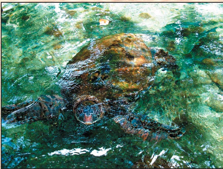
Kwajalein Atoll Nature winner: "Monet's Turtle Pond"