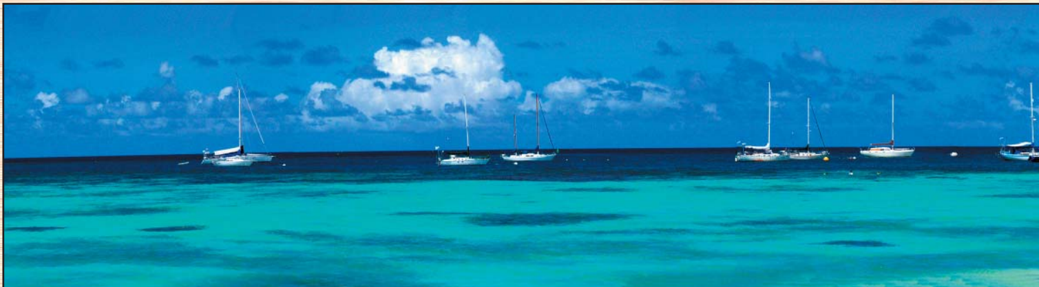
Kwajalein Atoll Recreation category winner: "Sailboats at Rest"