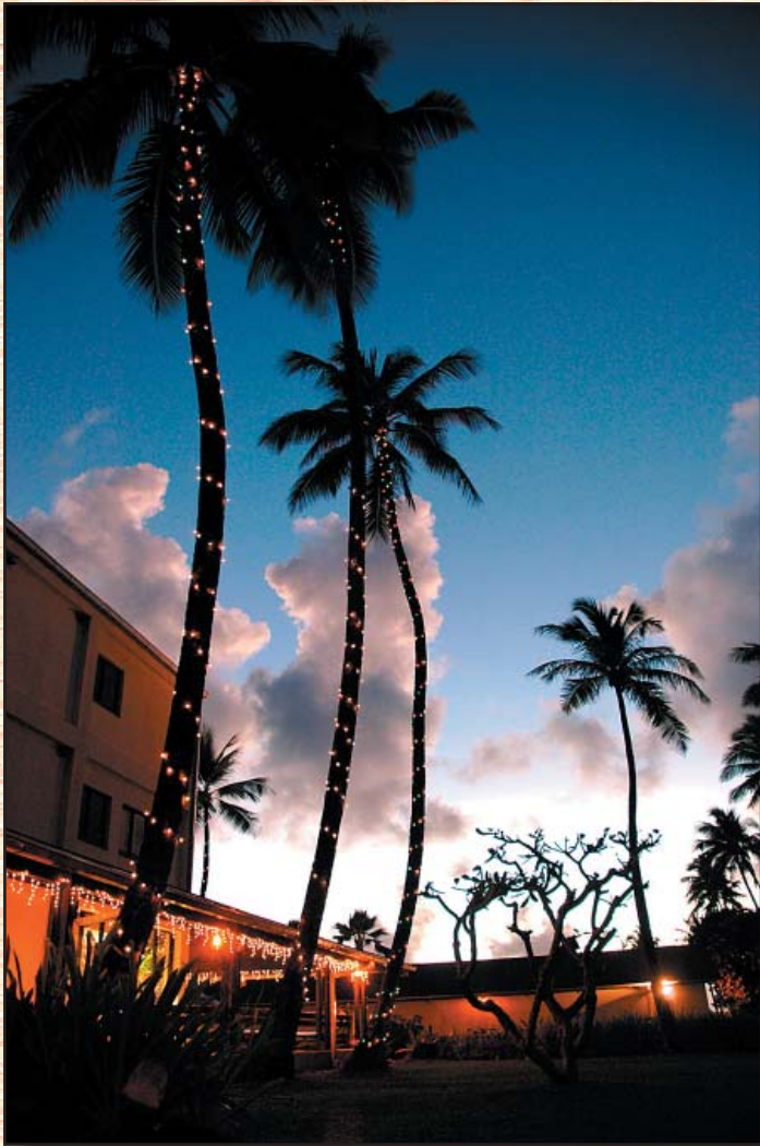
Kwajalein Atoll Holidays category winner: "Christmas at the Mall"