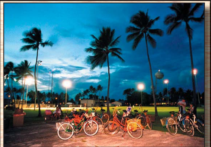
Kwajalein Atoll Living category winner: "Bikes at Night"