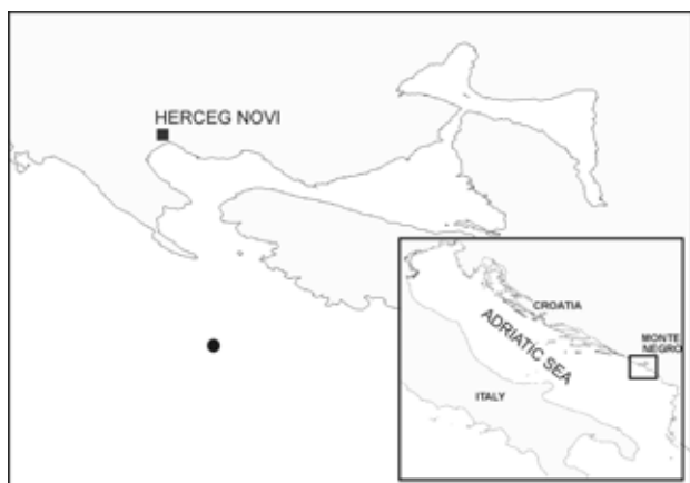
Fig. 1: Map with location where specimens of the yellowmouth barracuda were caught (Adriatic Sea, Montenegrin coast, 6 Nm off the shore of Herceg Novi).

Three specimens of the yellowmouth barracuda S. viridensis , caught by professional fishermen with purse seine and small driftnets in July 2004 about 6 Nm off the shore of Herceg Novi (the coast of Serbia and Montenegro) (Fig. 1) at depths between 10 and 15 m, have been obtained recently and accurately identified