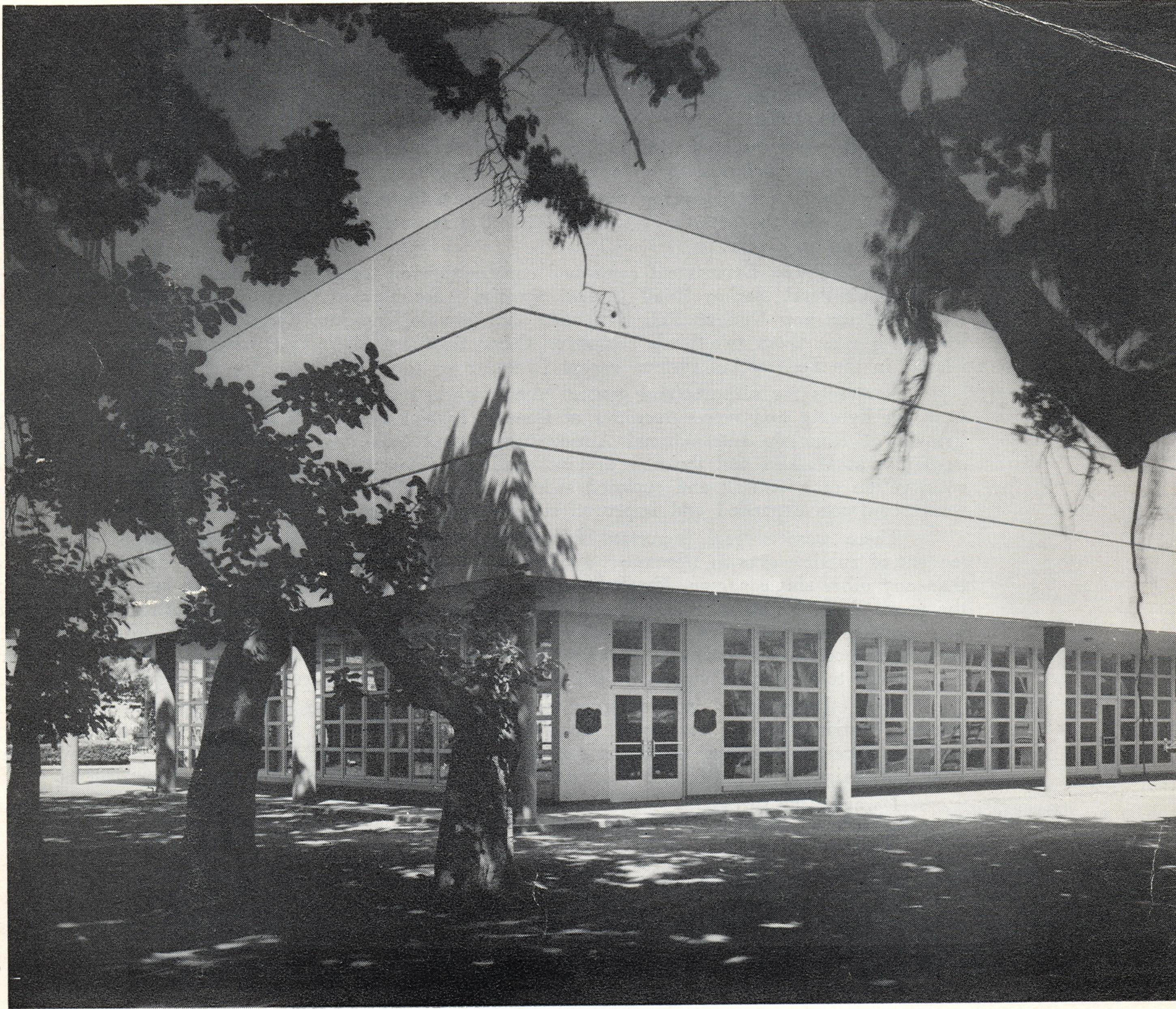
NEW ARCHIVES BUILDING