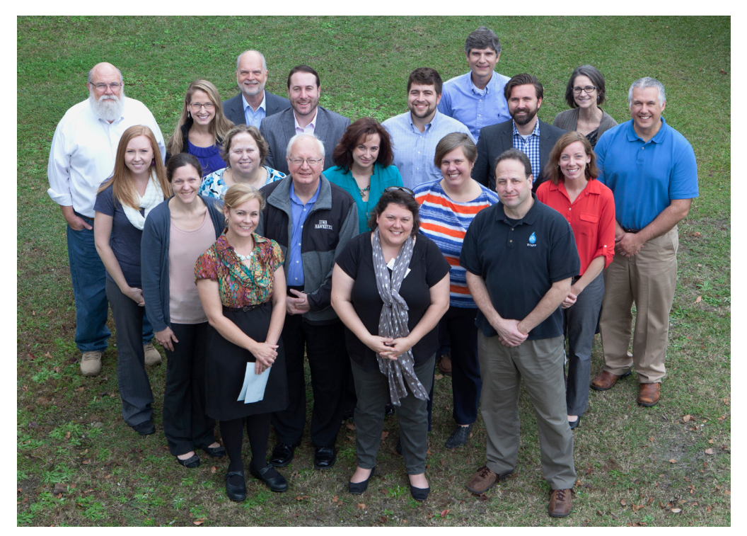
The Digital Coast is managed by NOAA's Office for Coastal Management, in coordination with the Digital Coast Partnership, a group that includes the American Planning Association, Association of State Floodplain Managers, Coastal States Organization, National Association of Counties, National Estuarine Research Reserve Association, National States Geographic Information Council, The Nature Conservancy, and Urban Land Institute.