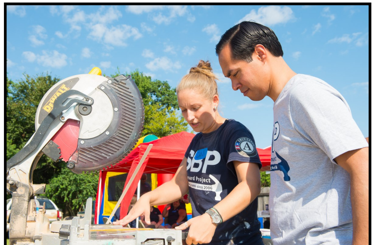
Secretary Castro working with volunteers of the St. Bernard Project in Louisiana.

Whether helping homeowners at risk of foreclosure to receive housing counseling, or connecting communities with resources to feed and house the homeless, our collaborative work has provided hope to communities stricken by the worst economic crisis since the Great Depression.