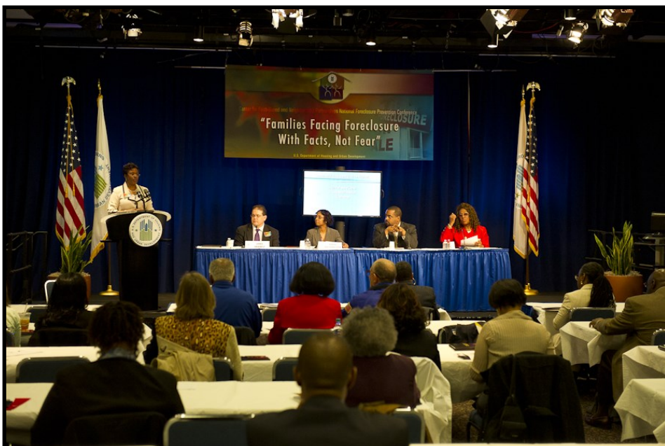
HUD CFBNP presents “Facing Foreclosure with Facts, Not Fear” conference, March 2011, Washington, DC

In 2009, the American Recovery and Reinvestment Act provided $2 billion through the Neighborhood Stabilization Program (NSP) to hard-hit communities struggling to reverse the effects of the foreclosure crisis. The goal of the program was to redevelop hard-hit communities, create jobs, and grow local economies by providing communities with the resources to purchase and rehabilitate vacant homes and convert them to affordable housing. By 2012, 56 grantees bought, rehabilitated and/or demolished nearly 18,000 homes to reduce community blight. In addition, the program assisted families to purchase these properties. Amidst this bigger picture, HUD CFBNP helped ensure that foreclosure prevention and scam awareness was a central focus of White House outreach to faith and community organizations.