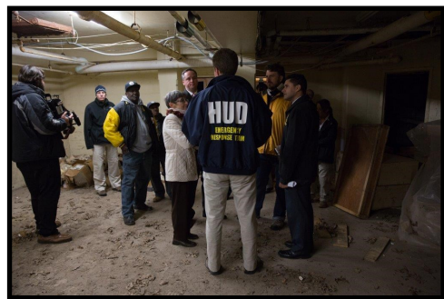
HUD’s Emergency Response Team inspects Hurricane Sandy damage.

Access to safe, decent and affordable housing represents an important foundation for sustainable livelihood, but housing becomes even more important in the wake of a natural disaster. When Hurricane Sandy struck the United States in 2013, HUD CFBNP swung into action. Center staff deployed to the hardest-hit areas to survey damage and convene roundtables of faith and community leaders to identify communities’ needs. In addition, HUD CFBNP worked with its sister center at the Federal Emergency Management Agency (FEMA) and participated in daily conference calls with faith, community and local government leaders in some of New York’s most damaged areas to track recovery progress and mobilize resources. In addition, HUD CFBNP updated its “Disaster Recovery Information Guide,” a booklet of Federal, state, local non-profit and philanthropic resources to help communities recover from disaster. More than 45,000 copies of the guide have been distributed to individuals and communities in New York and nationwide to help them prepare for, respond to and recover from disaster.