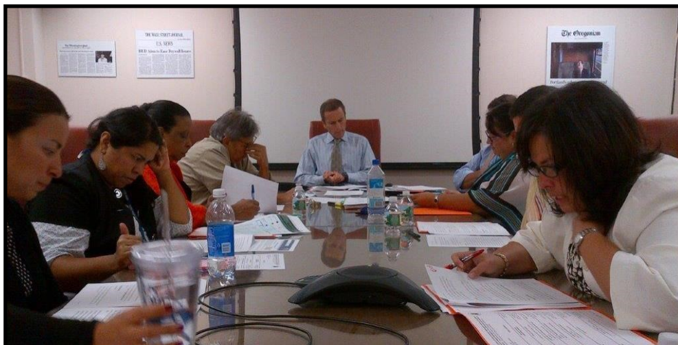
Members of HUD's affinity group Latino Network conducting a stakeholder call in Spanish about housing counseling and foreclosure prevention.

In addition to focusing on foreclosure prevention and recovery as well as the benefits of HUD-funded housing counseling, a major focus of the conference call series addressed preventing and combatting homelessness. During the Obama Administration, HUD adopted a " housing first " strategy to provide stable housing and supportive services as a foundation to address other issues many homeless families and individuals face. During this time, the agency helped draft Opening Doors , the nation's first comprehensive federal strategy to prevent and end homelessness.