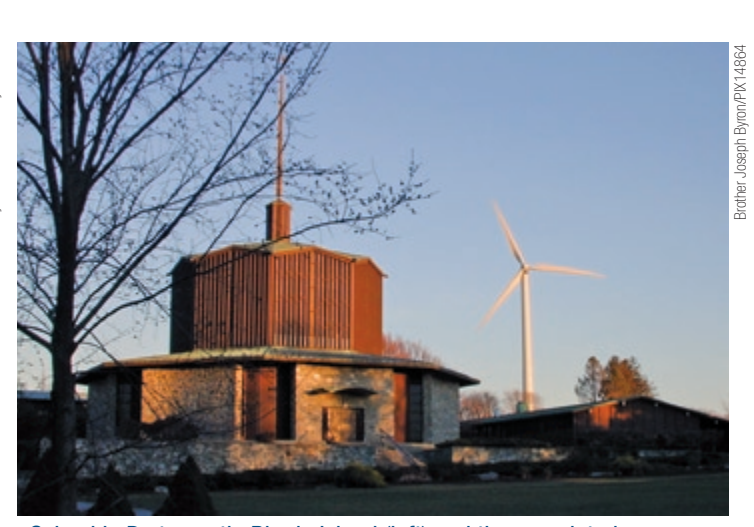
Before and after: a photo-simulation of the Vestas V-47 at Portsmouth Abbey School in Portsmouth, Rhode Island (left) and the completed installation (right).