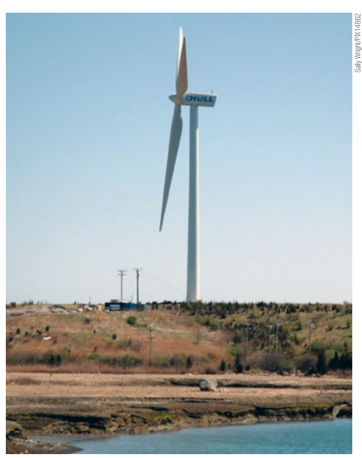
Hull 2 is the largest wind turbine in New England and the first U.S. installation on a capped landfill.

In 1998, we first started exploring the turbine options that ultimately led to Hull 1. We tried to establish a process that revolved