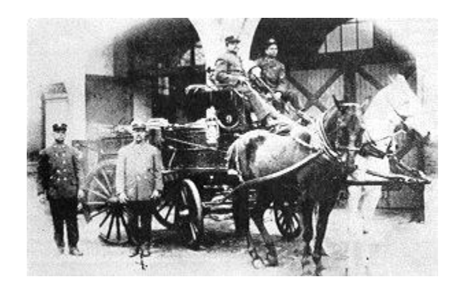
Firemen from Hose Company No. 9, Evansville, ca. 1910.

After the Civil War more and more African Americans moved from the South northward and cityward. Newcomers and many of the older residents left rural communities and the towns along the Ohio River to settle in industrial centers farther north. The largest number settled in Indianapolis, which has continued to have the largest Black community in the state, although the percentage of Blacks is greater in some other cities. Evansville is the only city in southern Indiana with a sizeable African American population.