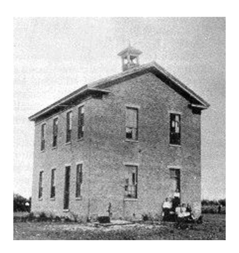
Union Literary Institute, an early school of higher learning, located in Randolph County.

at a nearby schoolhouse. Usually offering the mere basics of reading, writing, and arithmetic, they were open for the children of all who were willing and financially able to support the school.