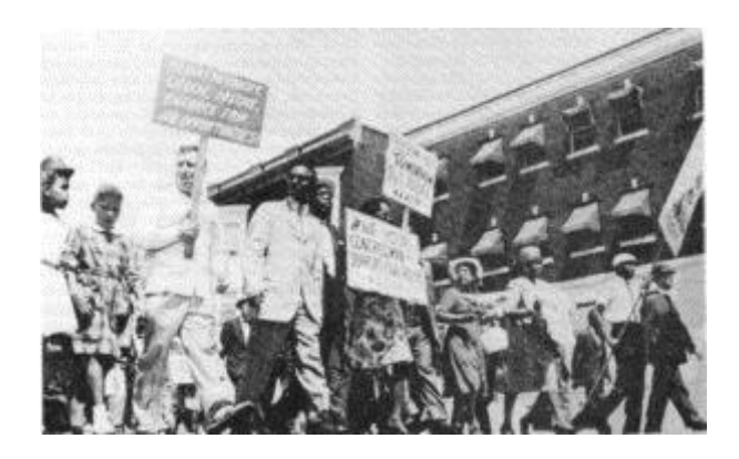
N.A.A.C.P. civil rights march in Indianapolis, 1963

In several cities branches of the National Urban League have worked against racial discrimination, particularly in the areas of employment and education. But the National Association for the Advancement of Colored People has had the longest and most notable part in the struggle for civil rights. The Indianapolis branch, founded in 1913, was followed by branches in other cities and towns throughout the state. A state conference was formed in 1929.