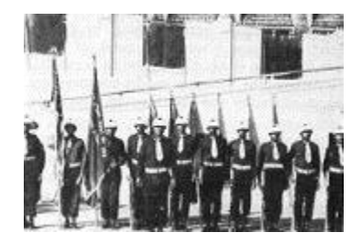
The national award-winning drill team of American Legion Post No. 359, Richmond, Indiana, ca. 1955.

In addition to their own churches African Americans also created their own fraternal, social, and cultural institutions and sought to meet their economic needs through their own business enterprises. From earliest times self-help, mutual aid, and volunteerism have characterized Black society. This has resulted in a veritable network of organizations.