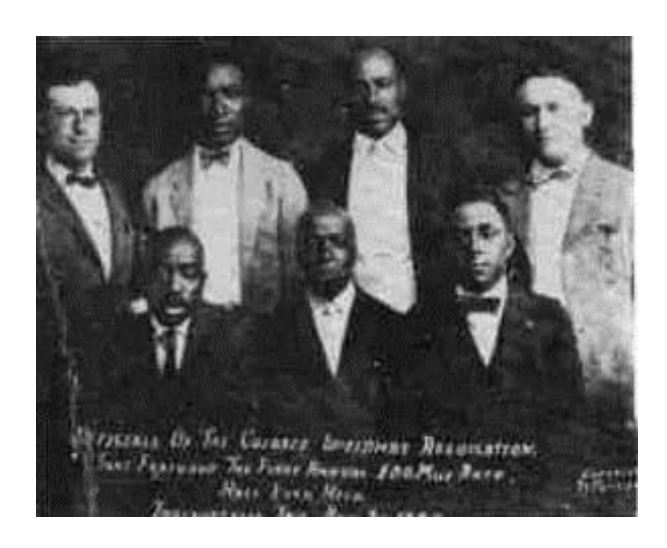
Colored Speedway Association officials, promoters of the Golden Glory Sweepstakes, Indianapolis.

Hoosiers love sports. Frequently excluded for many, many years from playing on all-white teams, African Americans created their own teams, which became symbols of race pride. Later, through their pre-eminence in almost all sports, Black athletes played an important role in breaking down racial barriers. Indiana history is dotted with those moments when an African American athlete's towering home run, breathtaking touchdown run, exhilarating slam dunk, devastating left hook, or spectacular auto win transcended the realm of sports to become symbols of the group's culture and racial achievement.