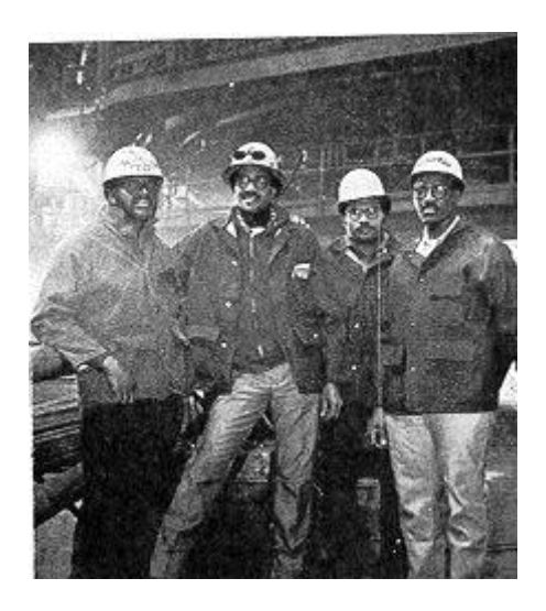
Foremen at No, 7 blast furnace, Inland Steel Company, East Chicago, 1982.

Decade after decade, United States census reports classed the vast majority of African-American men simply as "laborers," which meant that they usually did any kind of manual labor which was available. They were found in such occupations as those of teamster, hod carrier, waiter, porter, and janitor. A few worked in coal mines and quarries and a few in the building trades.