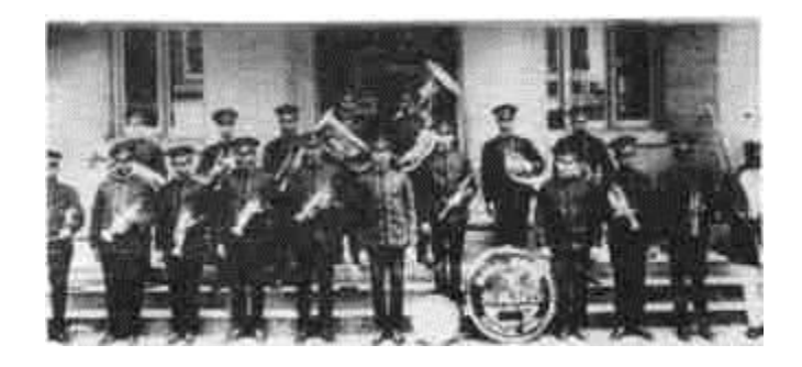
Ball Brothers Band, Muncie, 1922.

Many other musical entertainers who never became known outside the state traveled the Indiana circuit for years, performing at night and making a living at other jobs during the day.