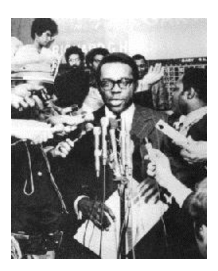
Richard G. Hatcher on election night 1971, when he was reelected as mayor of Gary.

Several African Americans have been elected to local judgeships, and a larger number have been members of city councils. The election of Richard G. Hatcher as mayor of Gary in 1967 was a political milestone in Indiana, as he became only the second African American mayor of a major northern city. His successive bids for reelection made him a nationally influential figure.