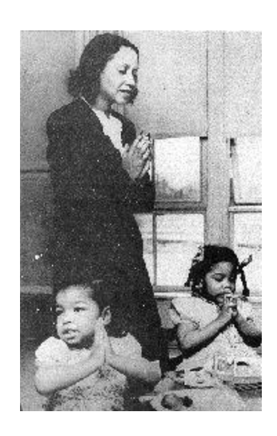
Spirit of prayer captured at Flanner House, Indianapolis, ca. 1955.

Churches have served the needs of their members through a variety of activities and a network of church organizations. Church choirs and other musical groups have served a spiritual purpose and a social purpose as well as developing musical talents. Sunday schools, men's groups, women's groups, and youth groups have also served social as well as religious purposes through dinners, teas, picnics, and annual outings.