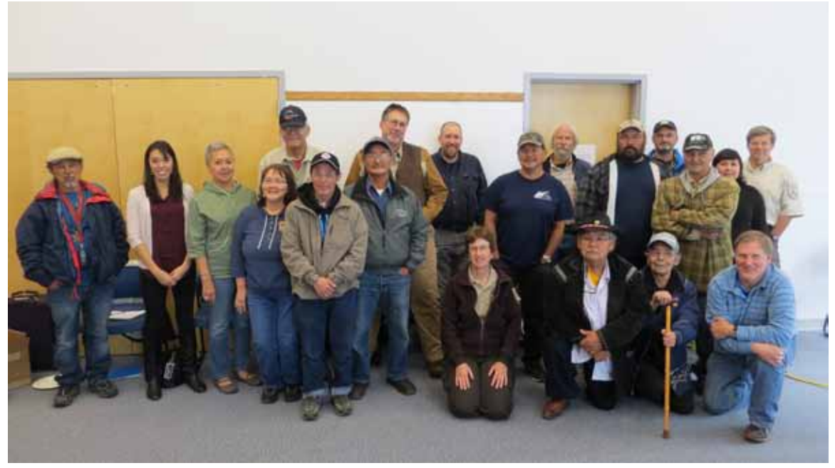
Group photo of the Qayassiq Walrus Commission at their September 2014 meeting.