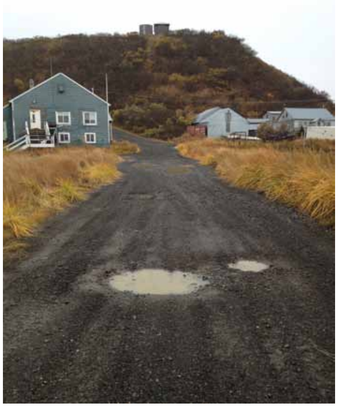
Road in Clark's Point, Alaska.