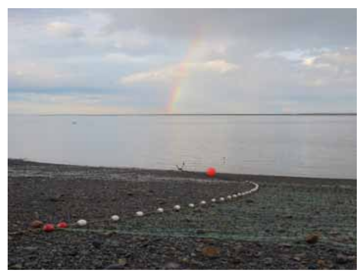
A subsistence gillnet at low tide near Dillingham, Alaska.

The U.S. Fish & Wildlife Service has a subsistence program for migratory birds, which funds the Alaska Native Migratory Bird Co-Management Council. The Bureau of Indian Affairs has small PL 93-638 eligible programs related to subsistence or other fish and wildlife management linked to