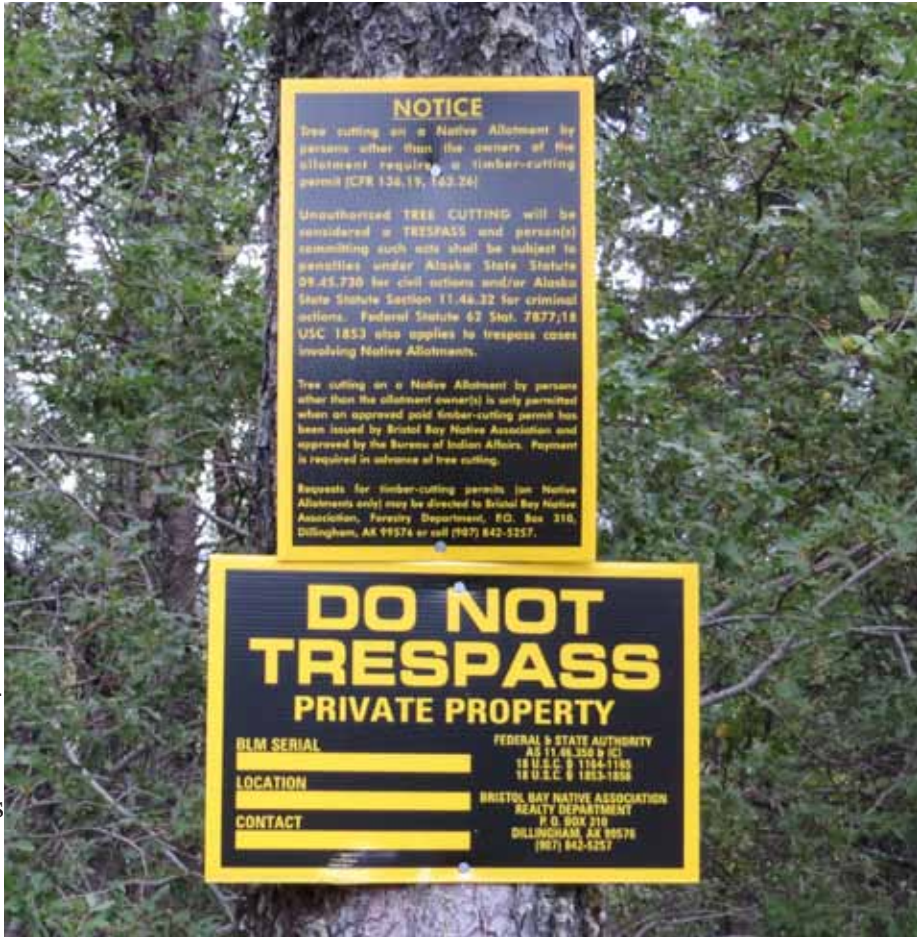
can be issued. The allotment applicants could compel the re-conveyance Pictured: A Notice sign explaining unauthorized tree cutting along with a Do Not Trespass sign on a parcel of Native Allotment land near Bristol Bay, Alaska.

A particular problem affecting about a dozen pending allotment applications in Bristol Bay has to do with allotment claims on land that was previously and erroneously conveyed to the state. The state had the right to challenge these allotments and did so, but in general it has allowed allotments to proceed. It will give the land back if the allotment applicant agrees to restrictions such as setback requirements. However, some applicants with fully adjudicated allotments and the absolute right to the land do not wish to accept state conditions, and these allotments have simply languished for years. The state won't convey the land back to BLM so the allotment patent can be issued. The allotment appli-