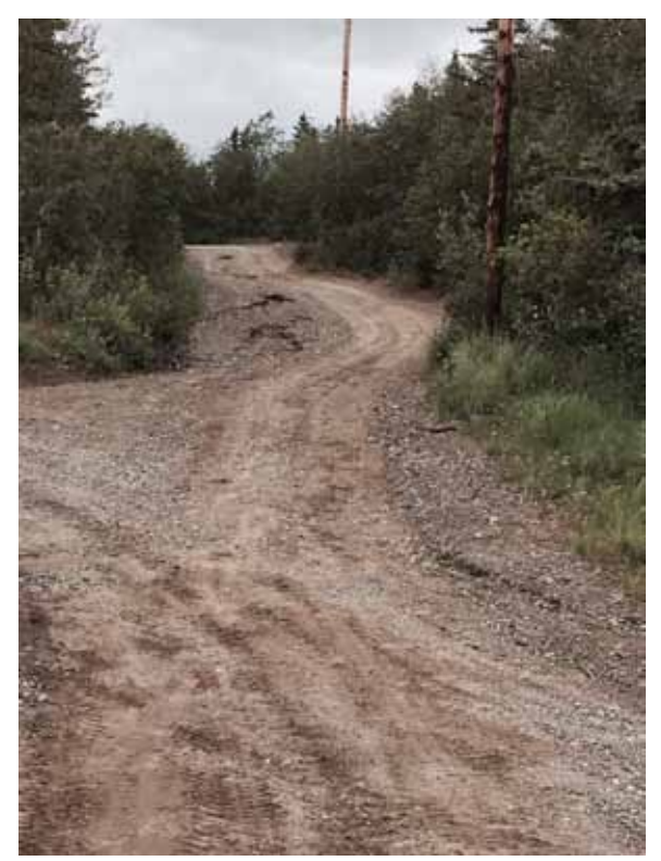
Road in New Stuyahok, Alaska.

We are concerned that side efforts to get a perfect solution for a given tribe or group of tribes might derail the national unity among tribes that the National Tribal Unity