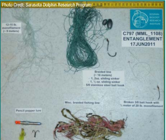
All fishing gear removed from a dolphin calf during a rescue event in Sarasota, FL.