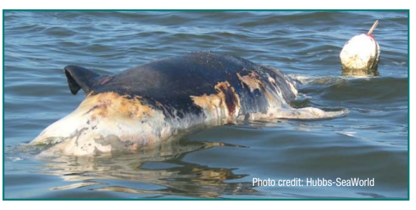
Bottlenose dolphin found dead entangled in crab pot gear in the Indian River Lagoon, Florida.

In Florida, commercial and recreational crab trap gear is commonly found in inshore bays and nearshore coastal waters. Between 2005-2009, 21% of bottlenose dolphins stranded with detectable evidence of fishery interaction from North Carolina through Texas coasts were associated with crab trap gear, 10% were in Florida. Winter was fortunate to have been rescued and survive the severity of injuries she sustained. Many entangled bottlenose dolphins do not survive.