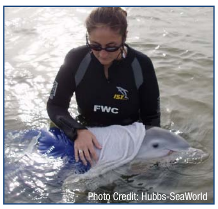
First Responders holding Winter up in the water prior to transporting to CMA