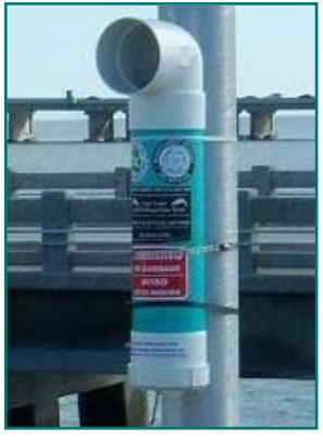
Monofilament Fishing Line Recycling Bin