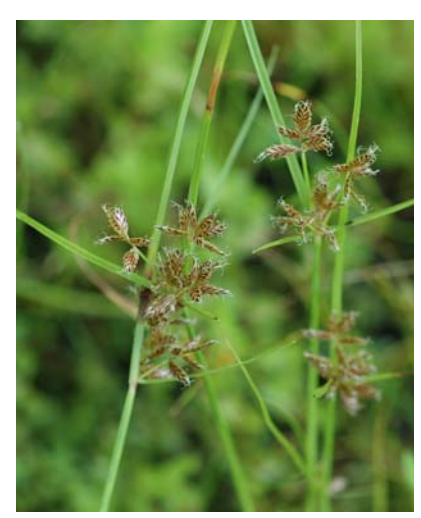
ODNR Natural Heritage Program