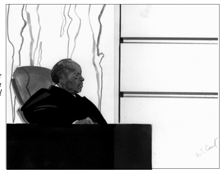
A federal judge presiding over a trial

Federal appellate and district judges are appointed to office by the President of the United States, with the approval of the U.S. Senate. Before their appointment, most judges were private attorneys, but some were judges in state courts, federal magistrate or bankruptcy judges, or U.S. attorneys. A few were law professors. Once they become judges, they are strictly prohibited from working as lawyers. They must be care-