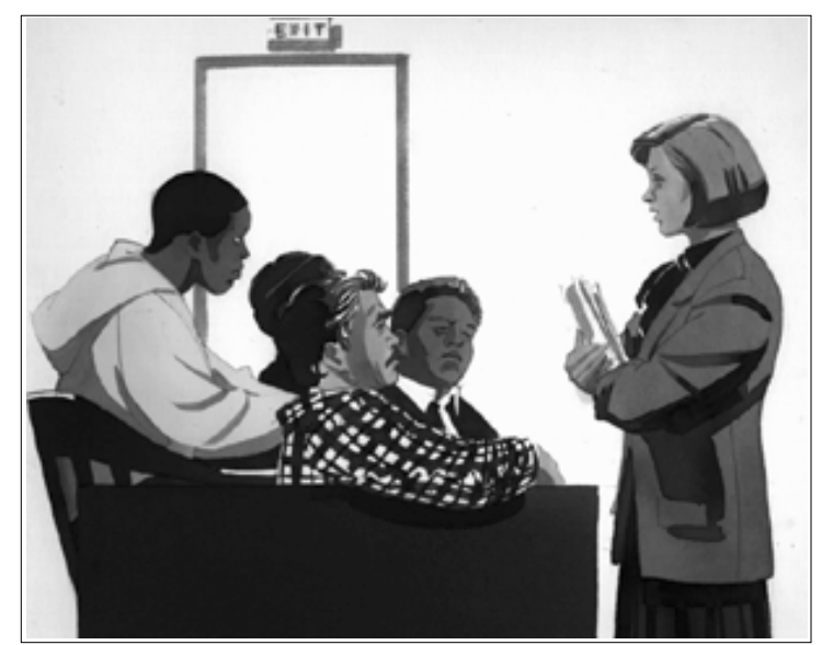
An attorney makes her opening statement to members of the jury

The lawyers often introduce documents, such as bank records, or