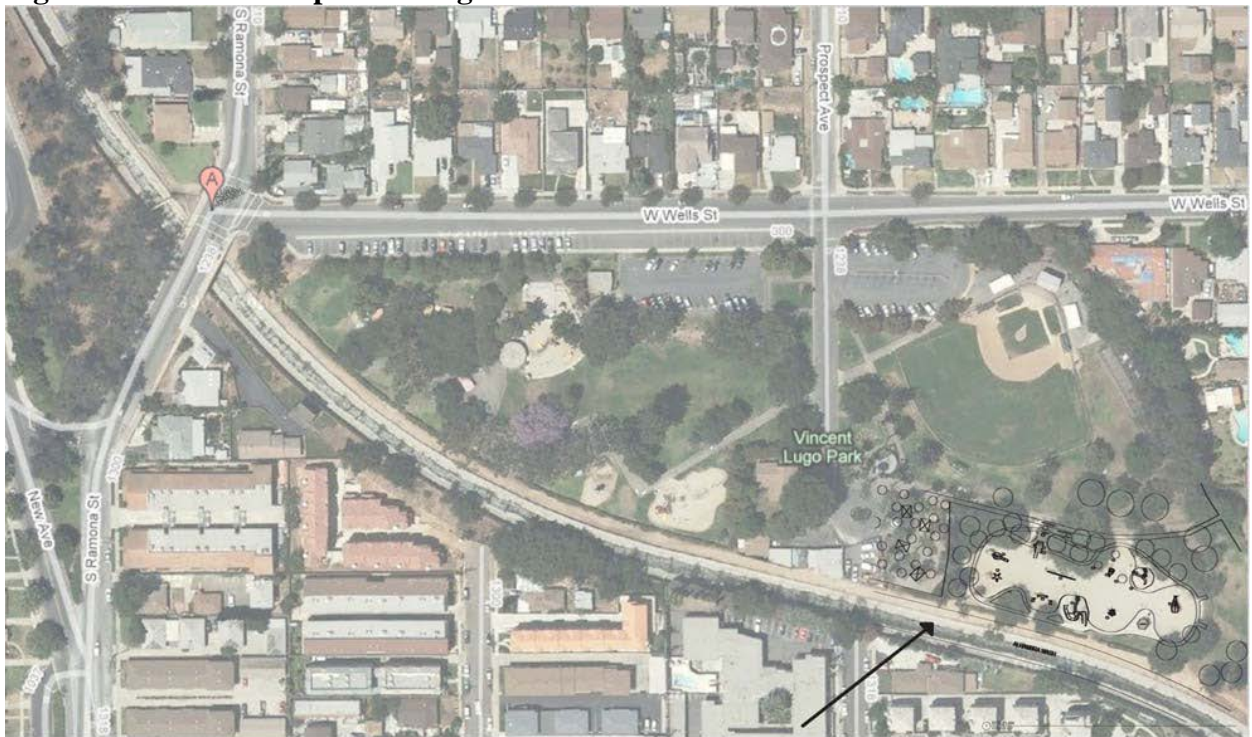
Figure 2: Location Map of La Laguna de San Gabriel

Los Angeles, California County and State