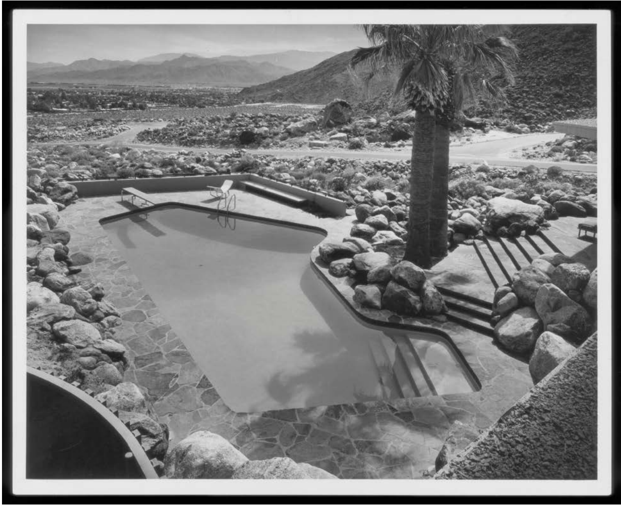
Figure 6. Swimming pool, looking southeast, 1954