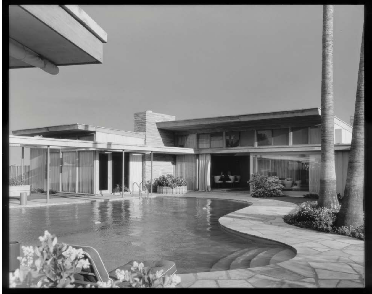
Figure 1. North and west elevations, looking southeast, 1949

(2004.R.10).