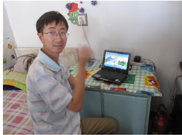
Fig. 2 – A ViD office with a notebook computer that can access the cloud-based EHR system.

The planned system is designated for rural areas usage including ViDs traveling to areas without Internet access, and contains features that help remove various operational barriers. These features include: