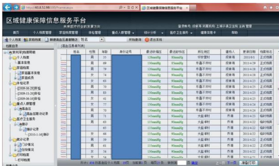
Fig. 4 – Screen showing follow-up information of patients enrolled in hypertension management.

In order to initiate preventive medicine efforts the ViDs were instructed to visit all patients in their area, and create electronic records containing the relevant public health