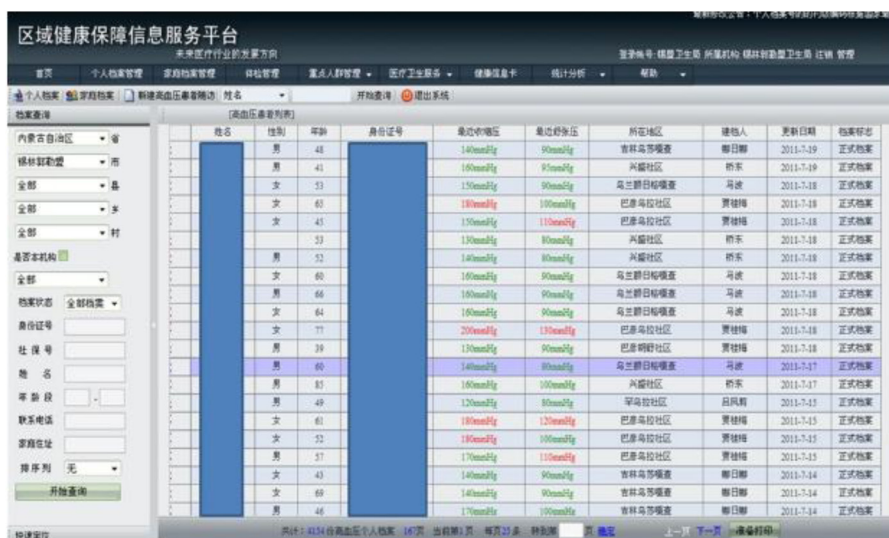
Fig. 5 – The PC screen highlighting abnormal blood pressure (red) of the hypertensive patients. (For interpretation of the references to color in this figure legend, the reader is referred to the web version of this article.)

information. The data collection efforts included visits to nomadic herdsmen, as this is a significant portion of the population. The preventive care measure specifically targeted high blood pressure and diabetes.