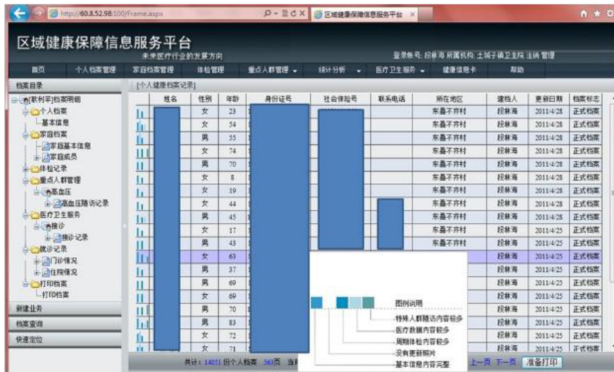
Fig. 3 – An image showing patient health information present in EHR (patient ID has been removed from the figure as privacy protection protocol).

is also verified for keeping unauthorized machines from accessing the system. The connection is secured with TLS1.0 encryption and software was checked for vulnerabilities to avoid problems such as SQL injection.