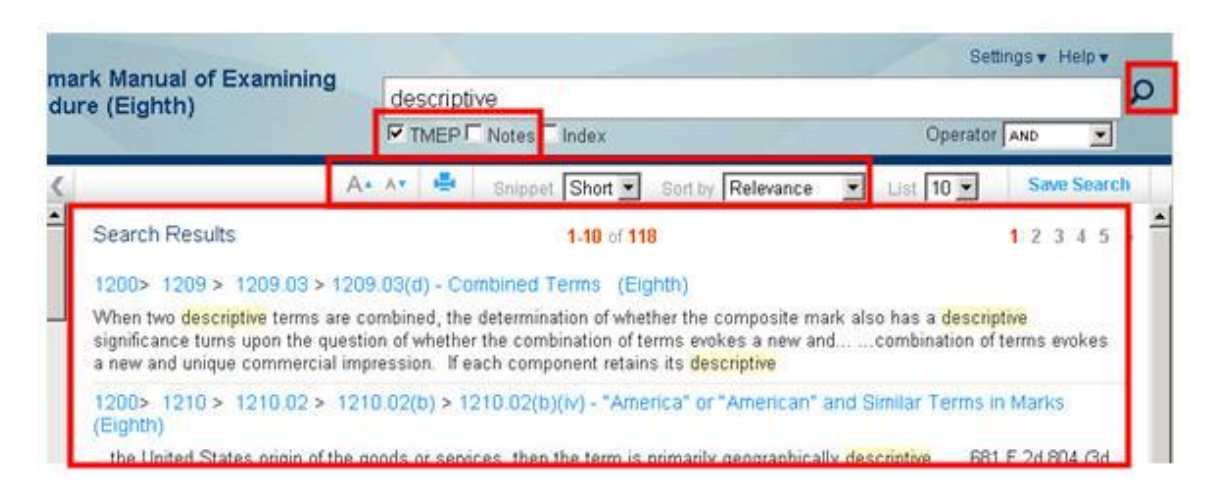
Figure 2. Search Results

1. In the search field enter a search query; see Figure 2 .