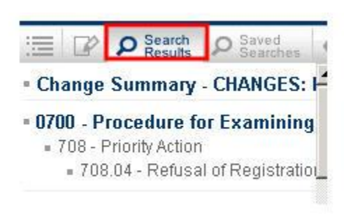
Figure 4. Table of Contents: Search Results Tab

• In the TOC, the Search Results tab will list only those sections featured in the Search Results document viewer. Click the corresponding section; see Figure 4 .