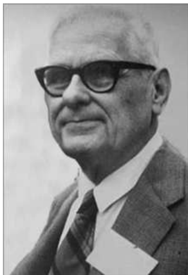
FIG. 7. Alonzo Church.

from that post because of failing vision and hearing. The family then moved to rural Virginia, where Alonzo Church and his younger brother grew up. He was an undergraduate at Princeton, graduating with an A.B. in mathematics, and then he continued as a graduate student, completing his Ph.D. there. Following a two-year post-doctoral National Research Fellowship, which he spent at Harvard University the first year, and the University of Gottingen and the University of Amsterdam the second year, he was invited to return to the Princeton Math Department, to begin his academic career there. He was a very important faculty member at Princeton for the next 39 years.