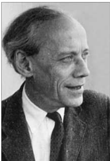
FIG. 9. Emil Artin.