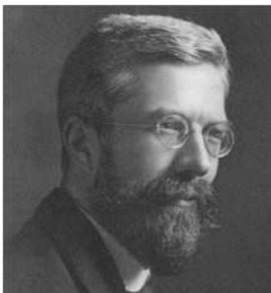
Ronald A. Fisher