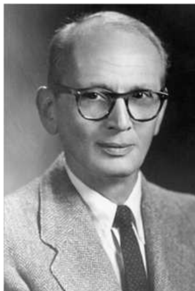
FIG. 6. Salomon Bochner.

Bochner was one of the foremost twentieth-century mathematicians whose research profoundly influenced the development of many different areas of analysis. He was born into a Jewish family in what was then a part of Austria-Hungary, and is now a part of