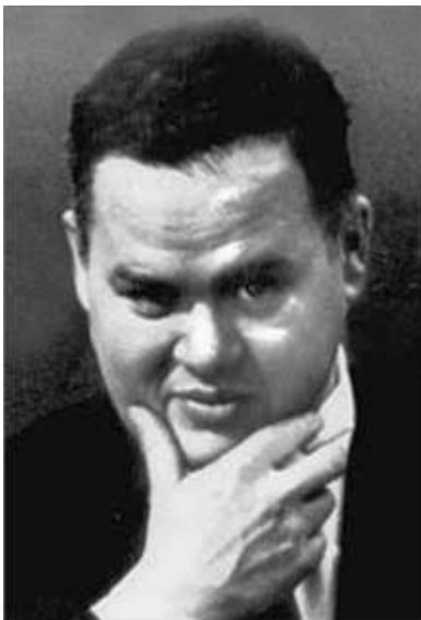
FIG. 5. John Tukey.

I then went off with the postcard in order to begin to think about the statistical problem and about what Tukey had meant in his one sentence about the problem. After thinking about this for a while, I found that I still just couldn't figure out what he had meant, and I finally just gave up trying to do so. But I didn't give up working on the problem. I worked on this for maybe three or four weeks, and then I wrote up the results that I had obtained in the form of a paper, but without putting an author's name on it. And I put the paper in Tukey's mailbox.