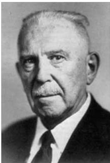
FIG. 8. Solomon Lefschetz.

Lefschetz was born in Moscow into a Jewish family (his parents were Turkish citizens), and soon after his birth they moved to Paris. He was educated there in engineering, and he emigrated to the U.S. when he was 21. Two years later, there was that terrible industrial accident. When he first came to Princeton in the 1920's, he was one of the first Jewish faculty members on the Princeton campus, and it is reported that he felt that people avoided him in the hallways and on campus on that account. He said that he was an "invisible man" there at the time. It is also the case that he could be rude, imperious, idiosyncratic and obstreperous, with a commanding (bossy) personality. He also was a man who had a really great amount of energy, a supercharged human locomotive.