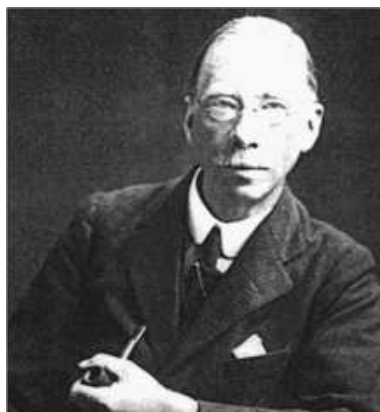
G. Udny Yule