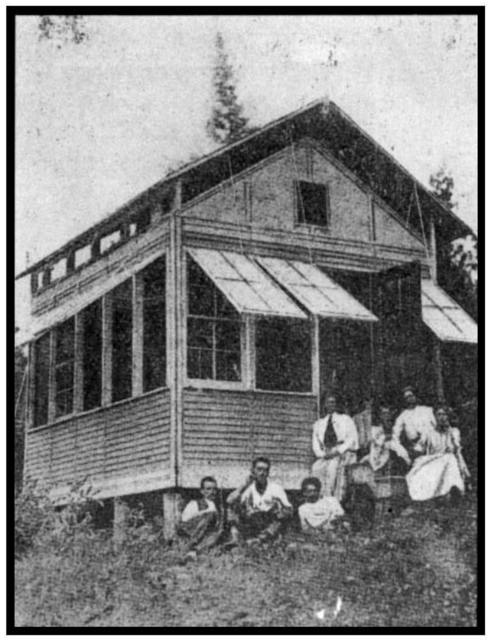
In the summer, many of Yungborn's guests stayed in 'air cabins" which were specially constructed to maximize circulation. Note the special roof construction to allow "healing" fresh air to constantly circulate though the building.

Groundless conjecturing was an unfortunate enough weakness. Worse was the willingness to accept into the naturopathic fold any therapeutic modality presented as "natural," no matter how outlandish the