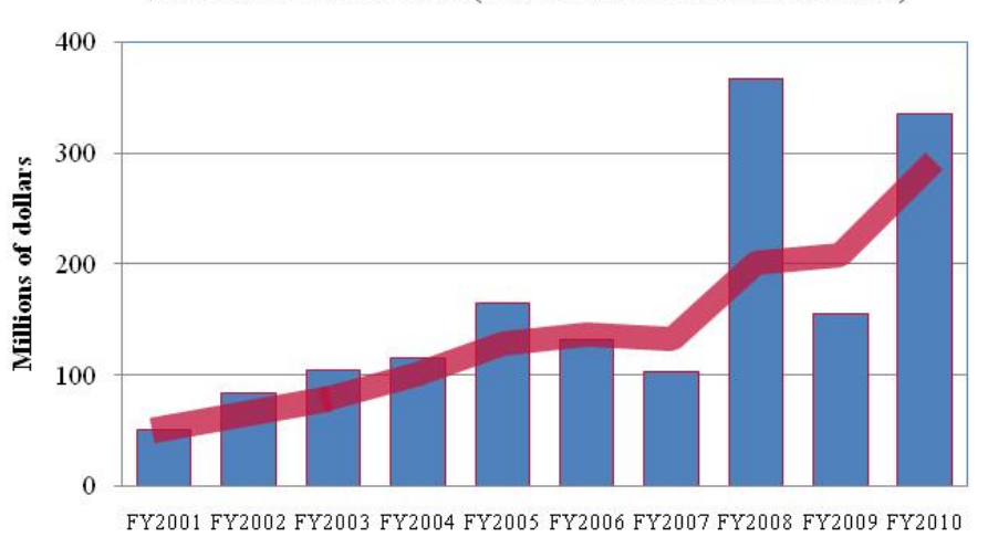
Graph 5. USG Funding for Trade-Related Agriculture, FY2001-FY2010 RED LINE SHOWS TREND (THREE-YEAR MOVING AVERAGE)

Following a sharp downswing in FY2009, TCB funding for agricultural support resumed its upward trend in FY2010 and was again over $300 million.