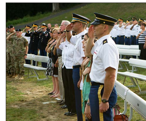
The West Point Fire Department (left) and the West Point community (above) renders a salute during the 9/11 ceremony on Sept. 9.