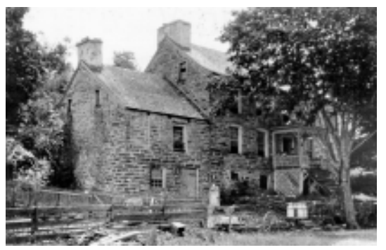
Van Campen House around 1900. The north (left) section was built around 1742 and torn down in 1917. The larger right section dates from the 1740s and 1750s. The porch dates from the 1800s.

Military Trail is for hiking only: no bicycles, automobiles, or motorized vehicles of any kind are permitted on the trail. Hunting is NOT permitted along the trail but the park recommends that hikers wear orange for safety.