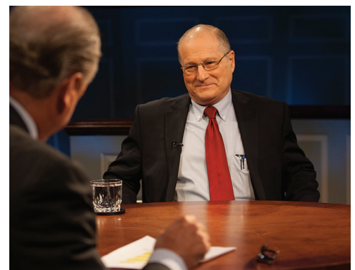
Ambassador Eric Edelman joined American Forum in March.

The entire episode and key excerpts are available online at millercenter.org/edelman-forum .