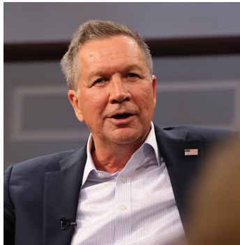
John Kasich during a February taping of American Forum