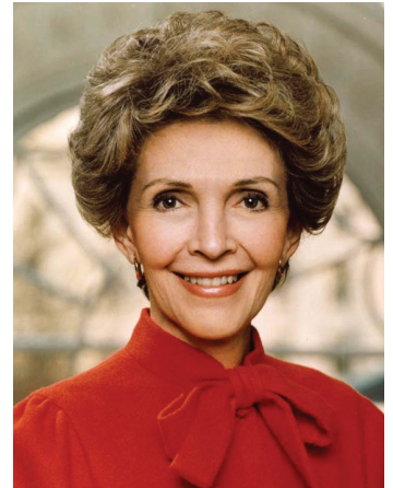
Former First Lady Nancy Reagan

Read more at millercenter.org/reagan-guide .