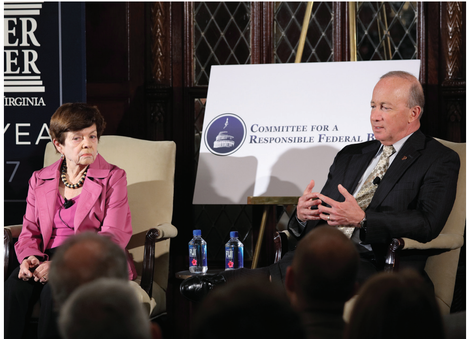
Former OMB directors Alice Rivlin (left) and Mitch Daniels headlined the 2016 Mortimer Caplin Conference in April.

Added Alice Rivlin, a senior fellow at the Brookings Institution who was the OMB director during the first Bill Clinton administration: "You've got a structural long-term deficit looming at you. You have to adjust taxes and entitlement programs and it takes a long time for any changes to take effect. So a fiscally responsible administration should take that on immediately."