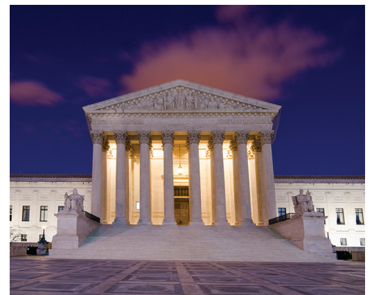
The U.S. Supreme Court at night

History, they said, suggests that "the most effective way to challenge a presidential Supreme Court nomination has been to conduct hearings and allow members of the Senate Judiciary Committee to air their views on the court and its direction."