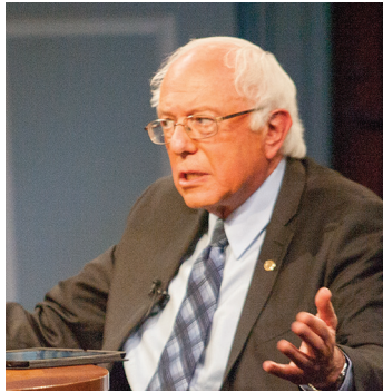
Bernie Sanders visited the Miller Center in October.

Both men also participated in private discussions with Miller Center scholars, staff, and supporters.