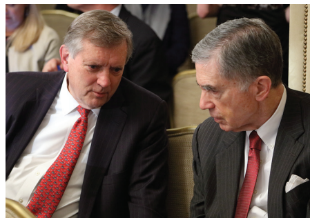
Former U.S. Congressman L.F. Payne (left) with former U.S. Senator Chuck Robb

The most important priority, Rivlin added, "is putting the social security system, which all older people depend on, on a firm fiscal foundation, which at the moment it is not."