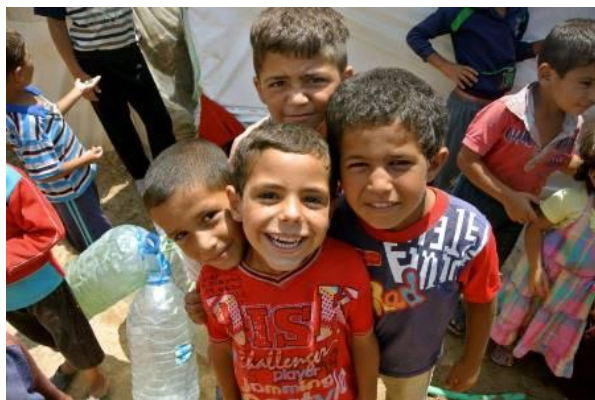
Children living in a makeshift settlement.

As part of capacity development to enhance capacity of UNICEF partners in education in emergency response, UNICEF organized and facilitated a 5-day training on the Inter-agency Network for Education in Emergencies Minimum Standards and Programming Education in Emergencies in Beirut. Thirty-three participants (27 female) from NGO implementing partners, Ministry of Education and Higher Education and UNICEF country and field staff participated in the training course, acquiring knowledge and skills to improve and apply the minimum standards into the education response in the current Syria crisis.