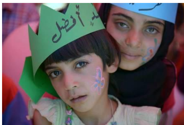
Two girls participate in Eid celebrations conducted by UNICEF partner Intersos in southern Lebanon.

Implementing partner International Rescue Committee (IRC) has provided support to 371 women and girl survivors of gender-based violence (GBV) and those at risk of GBV through activities in four Women and Girls Community Centres in Birqayel, Wadi Khaled, Arsaal and Bar Elias. A further 179 women and girls benefitted from community outreach activities, including a two-week social therapy workshop held for 20 Syrian girls. This brings the cumulative total for UNICEF-supported GBV interventions to 6,407 for the year. Access to the Arsaal community centre has been limited for the past fortnight, due to security concerns.