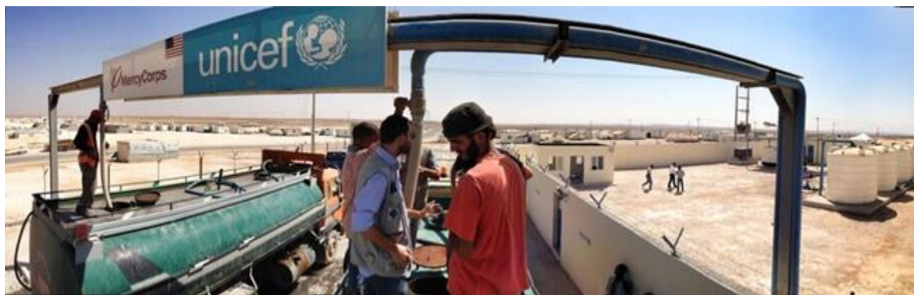
Za'atari Borehole I

WASH The drilling of Azraq camp borehole I is now completed to a depth of 500 metres. Well development and water quality testing is currently underway. Initial indications are that the well has a yield of up to 100m 3 per hour, which would be sufficient to meet the daily water supply needs of up to 55,000 people at 30 litres per person. Various sizes of pipe works (21km in length) have been installed in Azraq camp as part of the water supply network with a total of 61 water collection points (each with 4 taps) installed.