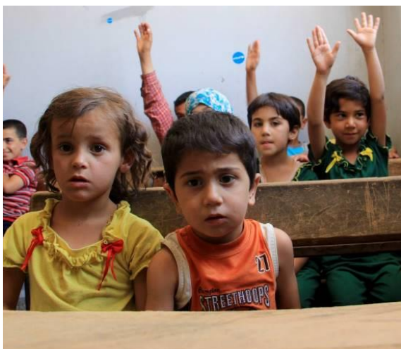
A mobile hygiene promotion team, supported by UNICEF, conducts a session for displaced children at a shelter in Hassayia.

WASH In 2013, in addition to chlorination efforts which have ensured safe drinking water for 10 million people, UNICEF's WASH programme has reached 3,132,096 people with water tankering, rehabilitation and maintenance of water systems. This includes the continued provision of safe water and proper sanitation and hygiene for 73,276 IDPs in Hama and Homs governorates, as follows. In Hama Governorate, UNICEF continued provision of safe drinking water through trucking to 2,110 people in Salamieh IDP shelters. In Homs Governorate - especially in Al-Waer neighbourhood of Homs City and Talbeeseh Town - despite very limited access to several areas - UNICEF and its partners have continued implementing water, sanitation, and hygiene promotion activities benefiting 71,166 persons. Hygiene messages and behaviour change campaigns are on-going, coupled with distribution of hygiene kits and soap bars to 26,000 internally displaced women and children. In addition, a water tank with a capacity of 45m 3 was erected in Alabbasiya neighborhood of Homs City, providing a storage capacity to serve 3,000 people.