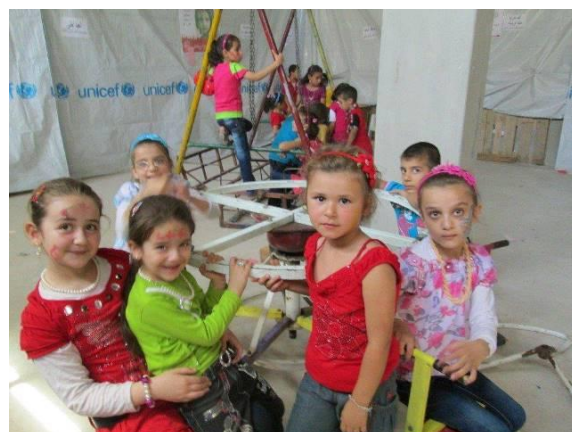
Children enjoy the opportunity to play with other children in a safe space, a SARC-run and UNICEF-supported centre in Talbiseh.

Finally, 80 volunteers received training on psychosocial support and Child Friendly Spaces through NGO partners in Aleppo and Lattakia. The pool of volunteers will reach at least 600 children over the coming months. In addition, UNICEF concluded a second round of training for partners in Tartous, on Minimum Standards of Psychosocial Interventions in Emergencies, targeting 10 managers and project coordinators from five NGOs. This series of training will help to have a unified knowledge platform on psychosocial in emergency among all partners, and ensure consistency and equality of services provided to all children, in addition to providing