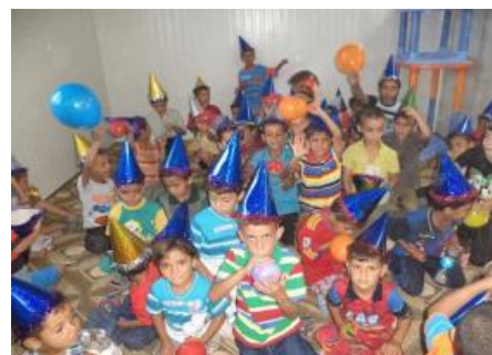
Children in Al-Obaidy Camp celebrate Eid.

Children at Al-Obaidy camp celebrated Eid Al-Fitr just like other children around the world, with games and everyday child friendly space activities such as story-telling. During this holiday period, four awareness sessions were arranged covering good behaviour and the risk and dangers of playing with fire.