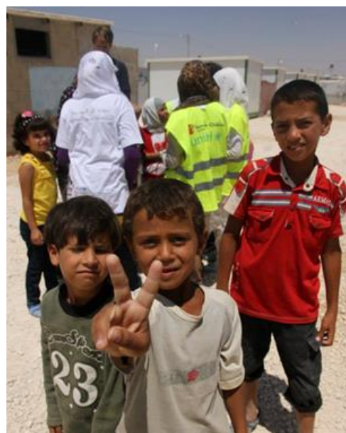
Back to school campaigners (background) talking with families in Za'atari

Following a joint mapping exercise which identified the most severely overcrowded schools, UNICEF and MoE teams conducted a 3-day field capacity assessment of the most crowded schools in 5 governorates in the host communities on 13 -15 August. A total of 78 schools were surveyed resulting in recommendations to double-shift 29 schools and provide prefab classrooms to 10 schools.