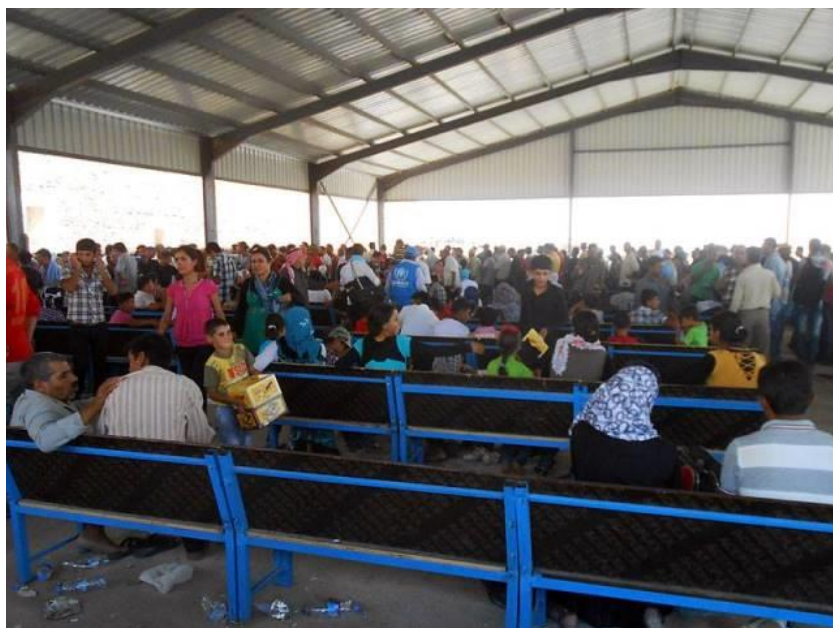
As the influx of Syrians into Iraq fleeing from the ongoing violence in Syria continues, UNICEF and partners rush to meet their urgent needs.

The Directorate of Water commenced the drilling of a borehole inside the camp boundaries and expects it