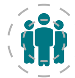
TRADE AREA POPULATION

— The mall is positioned at the intersection of I-95 and Stillwater Avenue—the major retail and commercial artery in the metro Bangor market.