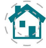
TRADE AREA HOUSEHOLDS