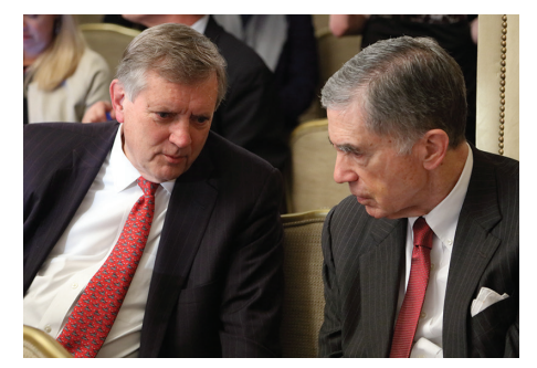
Former U.S. Congressman L.F. Payne (left) with former U.S. Senator Chuck Robb

The most important priority, Rivlin added, "is putting the social security system, which all older people depend on, on a firm fiscal foundation, which at the moment it is not."