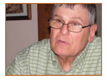
"I like living in my community"