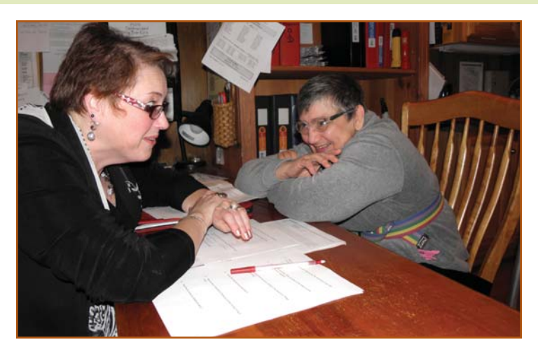
"I love living here. Nice people. I love living here. I have my own room!"