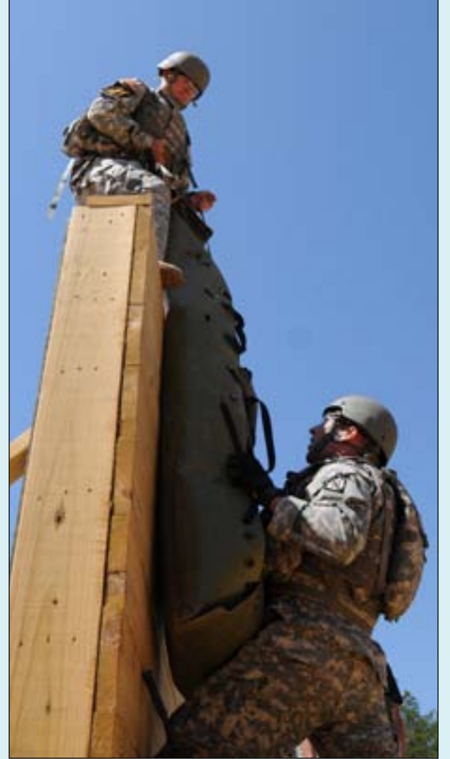
Oversight of contract support for the obstacle course and other base operations at Fort Benning, Ga., as well as grounds at six other Army installations now falls under the Mission and Installation Contracting Command's Mission Contracting Center-Fort Eustis. The standup of the intermediate level of command earlier this year was the first of seven MCCs projected to be established by the end of 2011.

Several considerations go into the team's decision making process to include the order in which the MCCs are stood up and continued support for the MICC's major customers. Following that process, specific IPTs are established to address the actual execution of