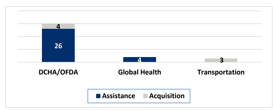
Figure 1. Ebola Awards Reviewed, by Division and Type

We conducted this audit to determine if USAID selected suitable types of awards for responding to Ebola, and if it made and modified the awards appropriately. To conduct our work, we reviewed 37 (out of 166) awards from three OAA divisions (figure 1): the Democracy, Conflict and Humanitarian Assistance (DCHA) Division, which provides acquisition and assistance services for the DCHA Bureau, including OFDA and the Office of Food for Peace (FFP); the Global Health Division, which provides acquisition and assistance services for the offices in the Global Health Bureau; and the Transportation Division, which provides acquisition and assistance services for the offices in the DCHA Bureau and the U.S. Air Force, as requested, for transportation and commodity management.