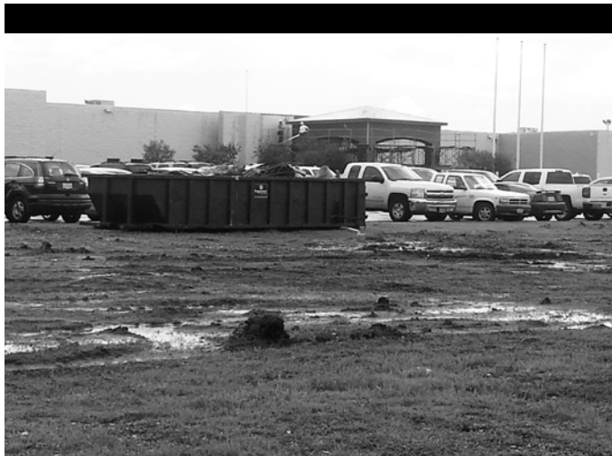
Outside of Karnes County Residential Center. Karnes has a 532-bed capacity. As of September 2014, 98% of the families at Karnes were seeking protection in the United States.