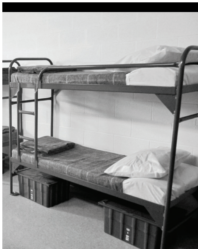
Bunk beds at Karnes.

Release from detention is critical for a family’s psycho-social well-being as well as the ability to access justice. Depending on a family’s situation, any decisions about their release will be decided by either an immigration judge or by an ICE officer.