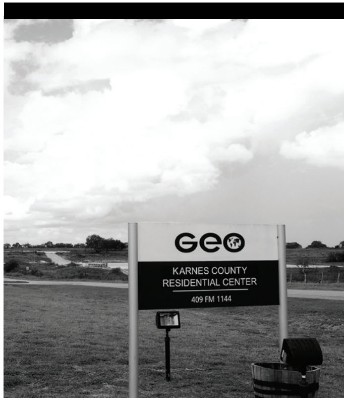
Road to Karnes County Residential Center. Karnes is an hour from the closest city, making it difficult for lawyers to provide legal service to detainees.

tem first reported by the USCIRF and additional abuses have been consistently documented through the present day. 61