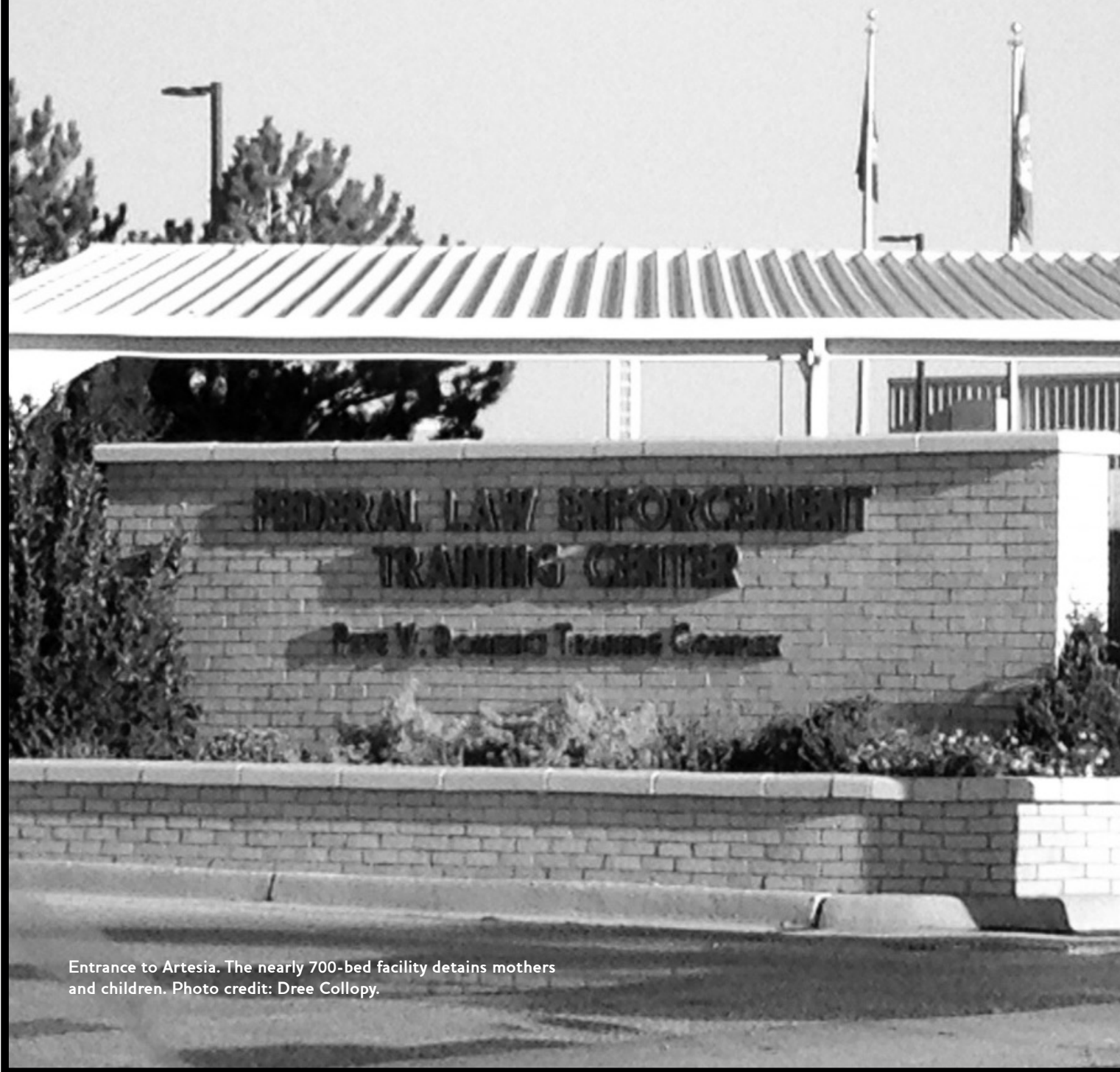
Entrance to Artesia. The nearly 700-bed facility detains mothers and children.

The Continued Failure of Immigration Family Detention