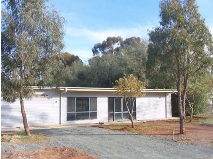
The 'new' Corop Community Centre in progress