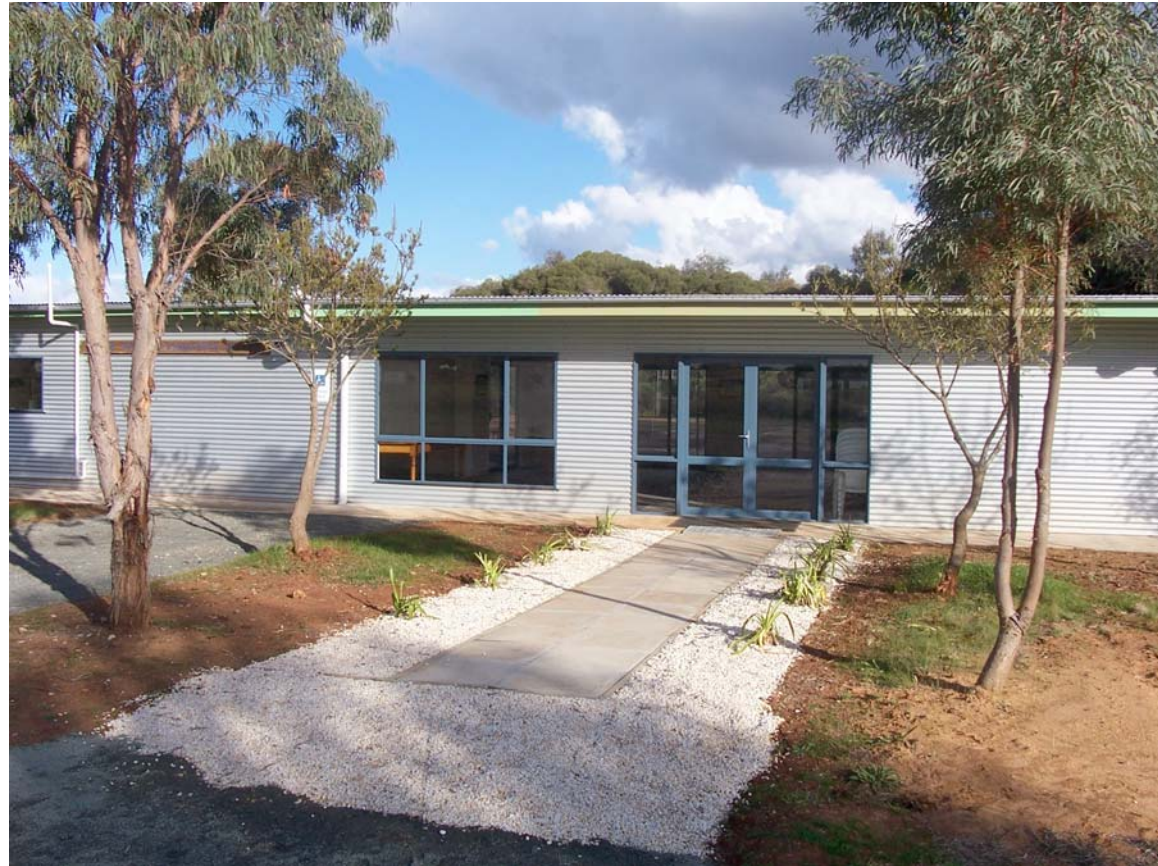
The 'new' Corop Community Centre