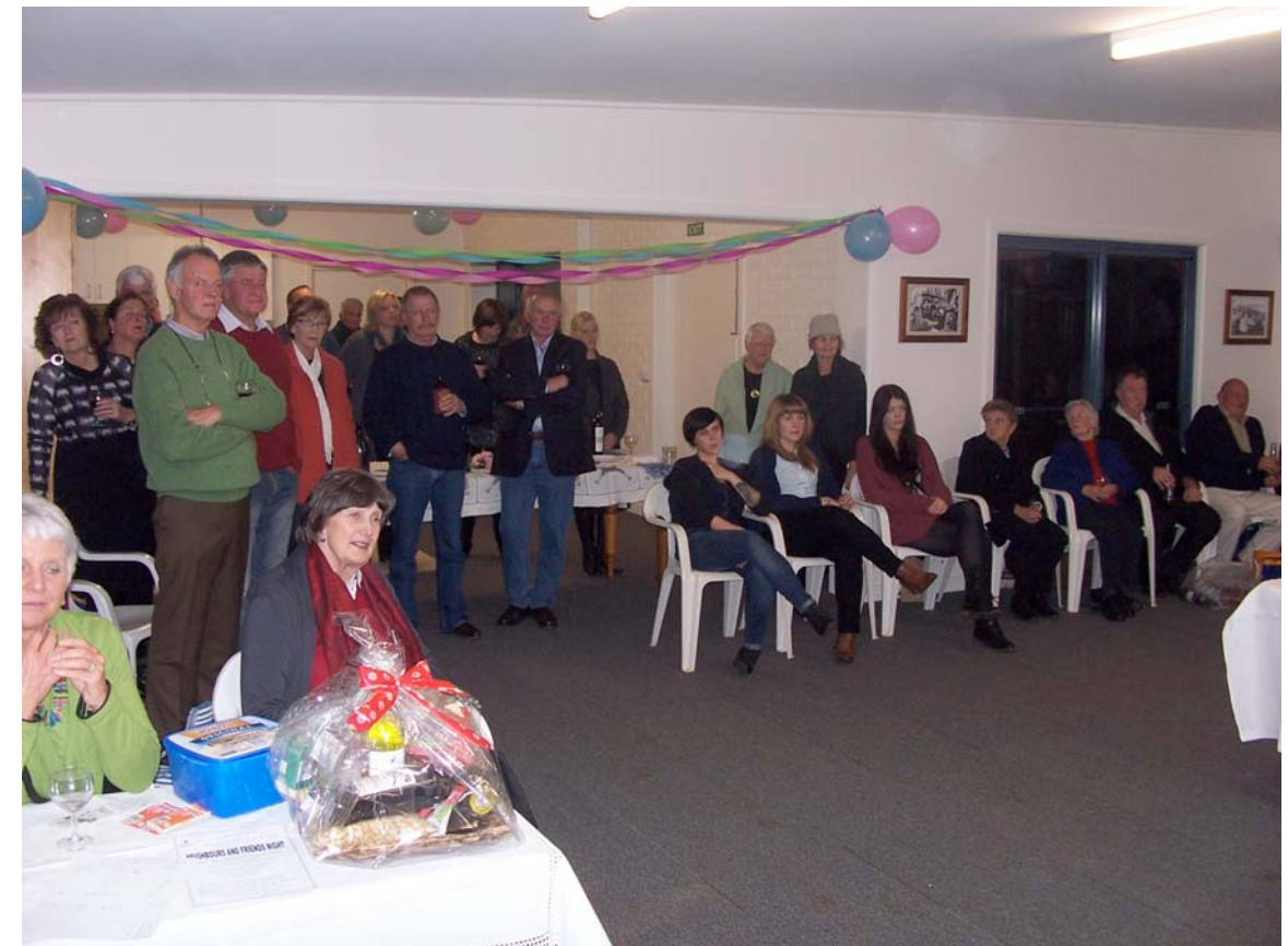
Part of the crowd of over 60 at the first gathering at the 'new' Corop Community Centre