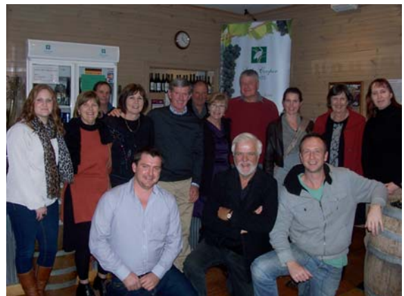
Some of the locals in attendance at the Friends & Neighbours Night

Another great night was had on Saturday 20th August at Lake Cooper Estate. Lots of good food, laughter, chat and cheer.