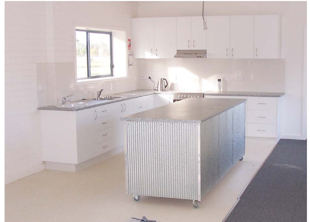
The luxury of having a kitchen in the community centre is one long awaited.