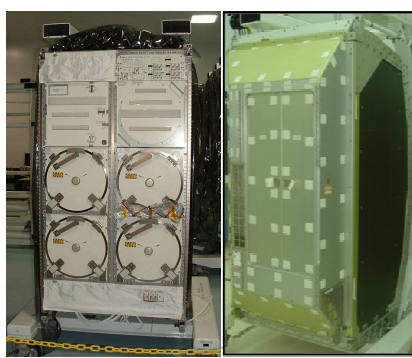
MELFI & Sleeping Quarters