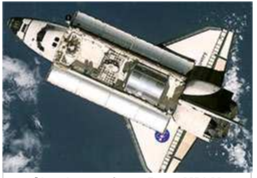
Shuttle carrying 4.5-ton MPLM