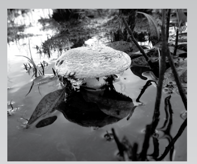
Pruitt's Amanita mushrooms at Fern Ridge Reservoir are unusual because they grow in seasonally flooded sites.

grass. The mushrooms at the reservoir are unusual because they the mushrooms floating in the water. Pruitt's about a mile away in native wet prairie.