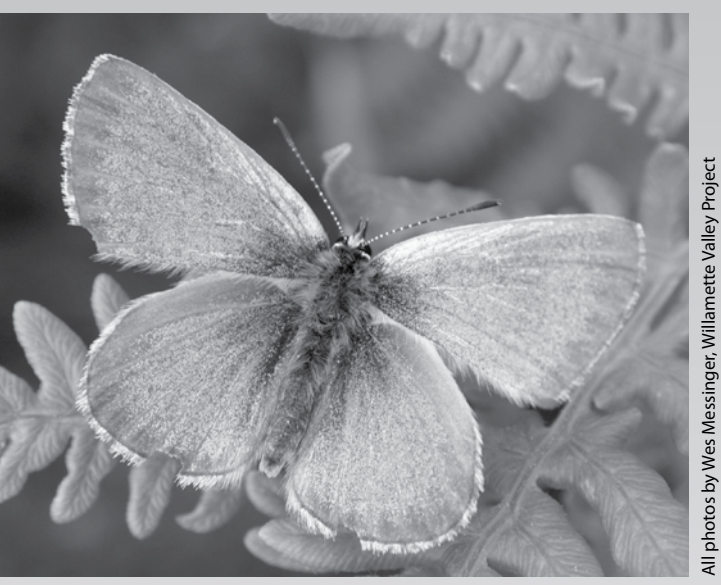
A worn male Fender's blue butterfly at rest on bracken fern. This individual emerged about a week earlier and is nearing the end of his life.

habitat by planting the butterfly's larval host, the federally protected Kincaid's lupine; control of invasive species; discovery of new populations; and improved monitoring methods.