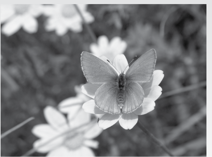
A newly emerged female drying her wings on woolly sunflower, an important native nectar plant.

The known population of Fender's blue butterflies has increased dramatically since their rediscovery. Corps biologists credit a combination of factors for the species' recovery, including restoration of prairie