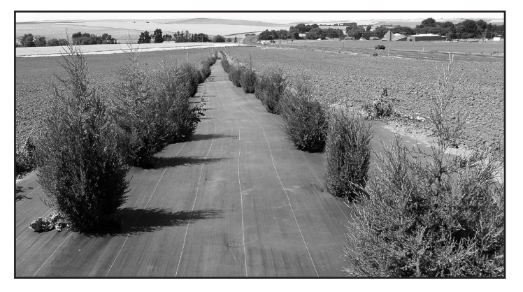
Rocky Mountain junipers were planted to make a living snow fence in Oregon.

was completed during the fall of 2004 with smoothing completed by disking prior to planting. ODOT selected a contractor to finish the disking, lay down the weed barrier fabric and plant the tree seedlings.