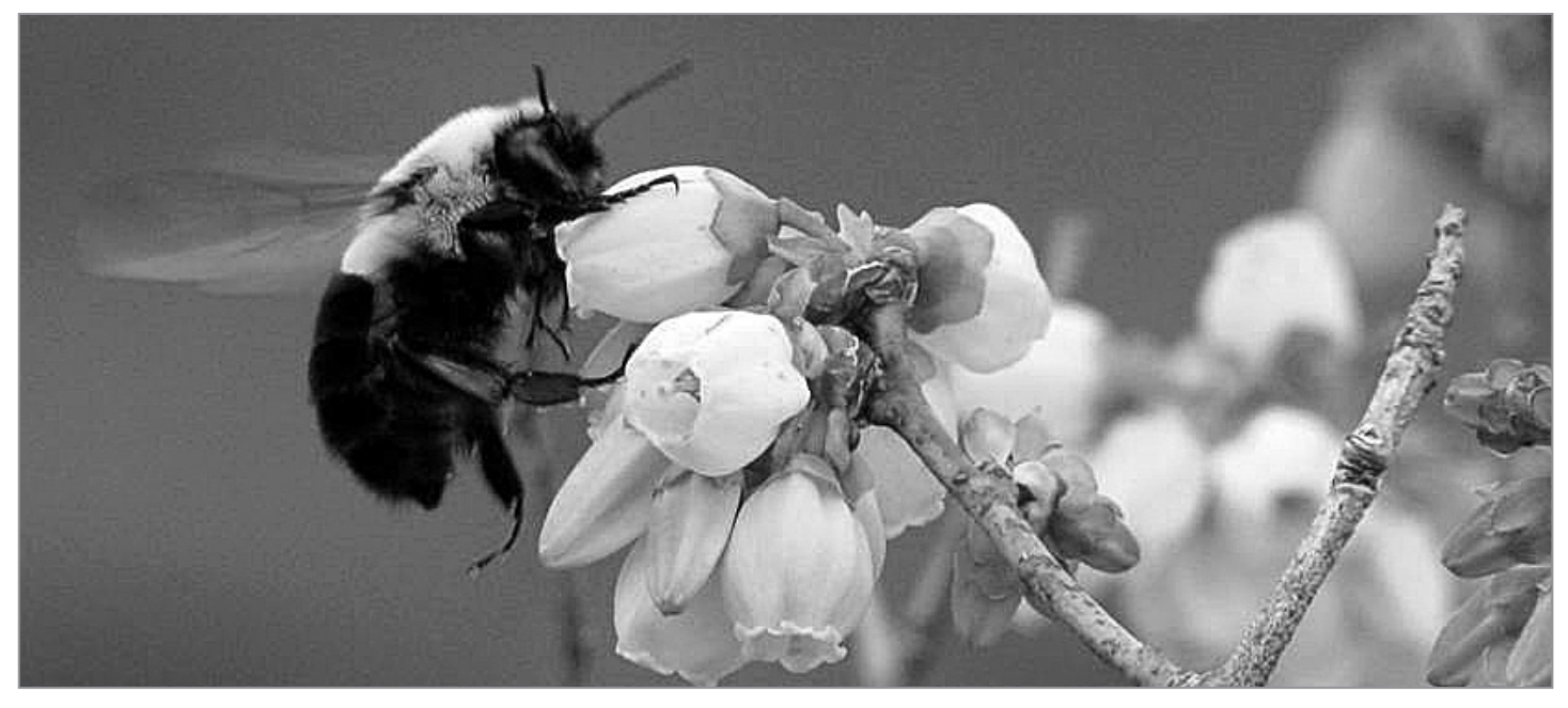
A bumblebee foraging on a blueberry blossom.