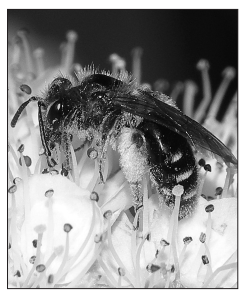
A sweat bee gathers pollen on a nine-bark.

Besides providing habitat and safety for pollinators, the additional agroforestry