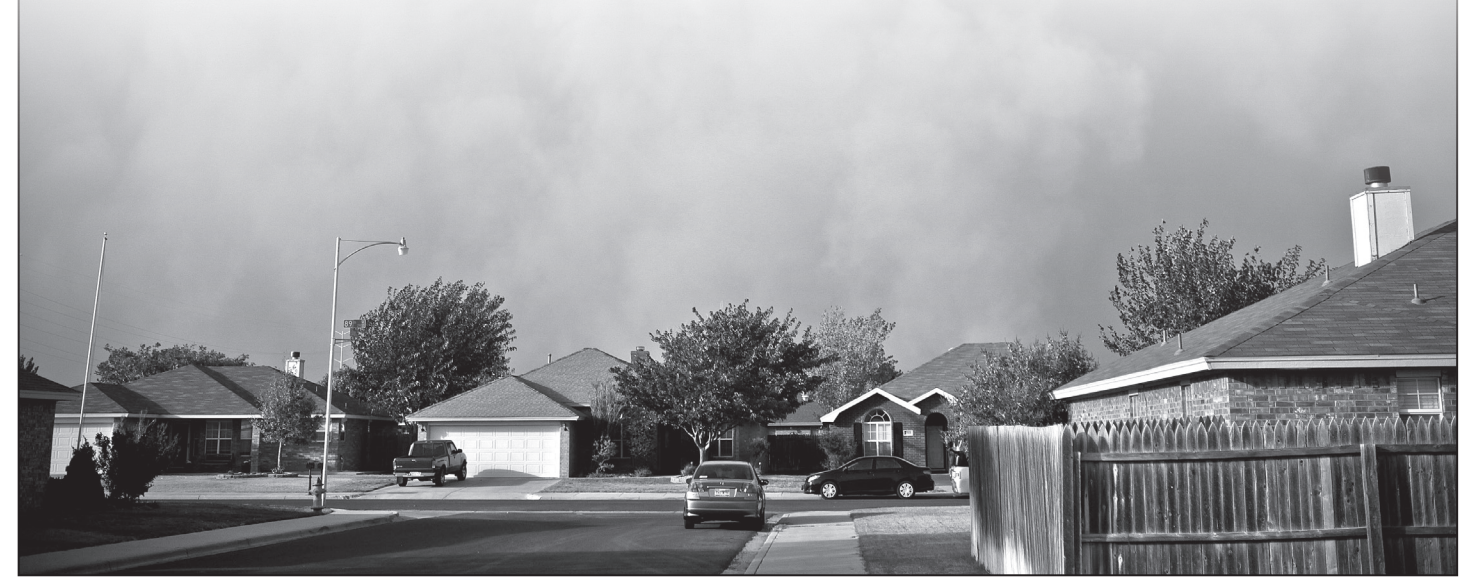
A huge cloud of dust looms over Lubbock, TX, during an October 2011 dust storm.

Richard Straight Lead Forester National Agroforestry Center Lincoln, NE