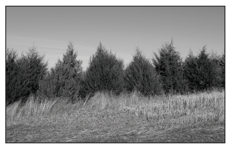
Rocky Mountain juniper after 7 years of growth are filling in and should be capable of catching and holding blowing snow.

The next step was to remove the existing snow fence structure so the site could be readied for planting. To ensure seedling survival, deep ripping the soil to break up any root restricting layers