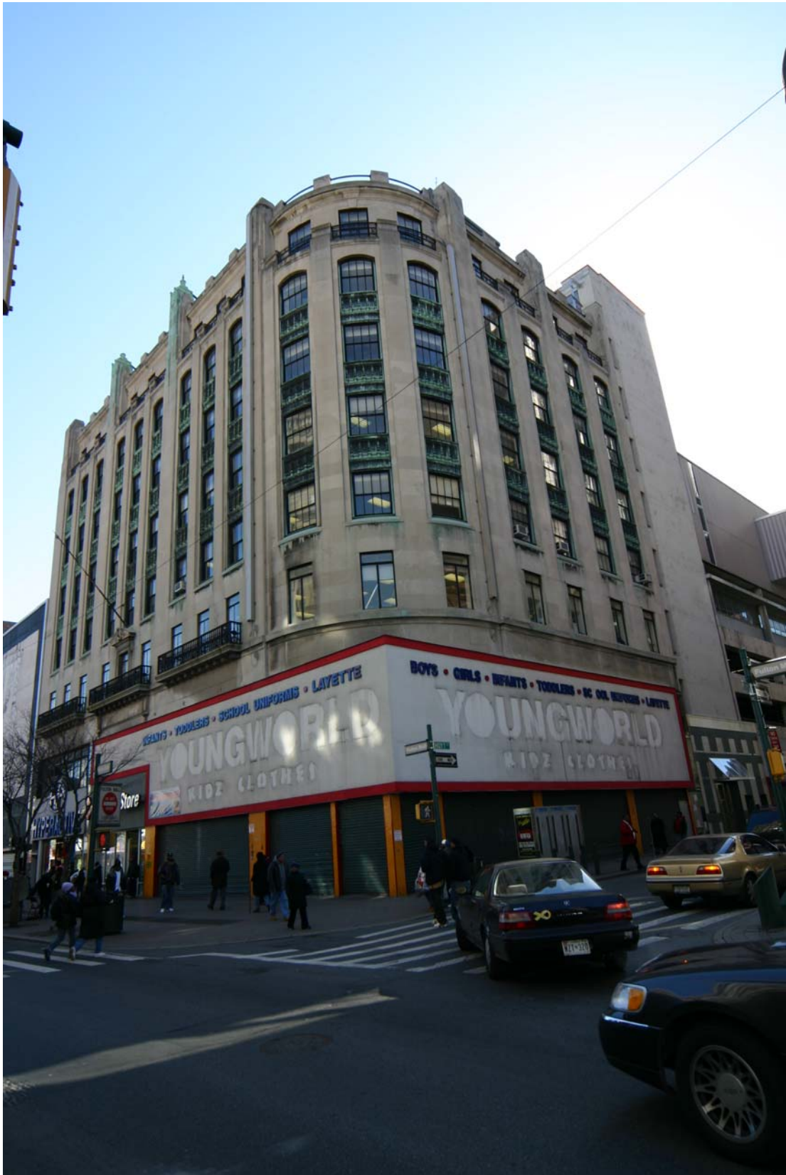
A. I. Namm & Son Department Store, 450-458 Fulton Street, Brooklyn