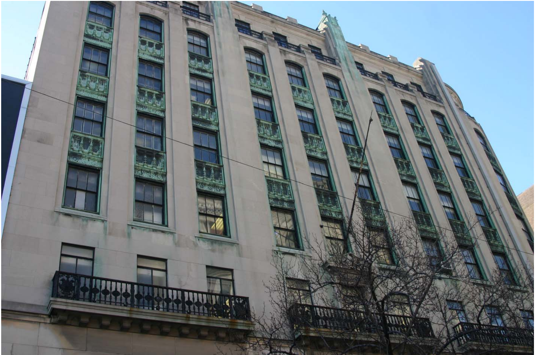
A. I. Namm & Son Department Store, 450-458 Fulton Street