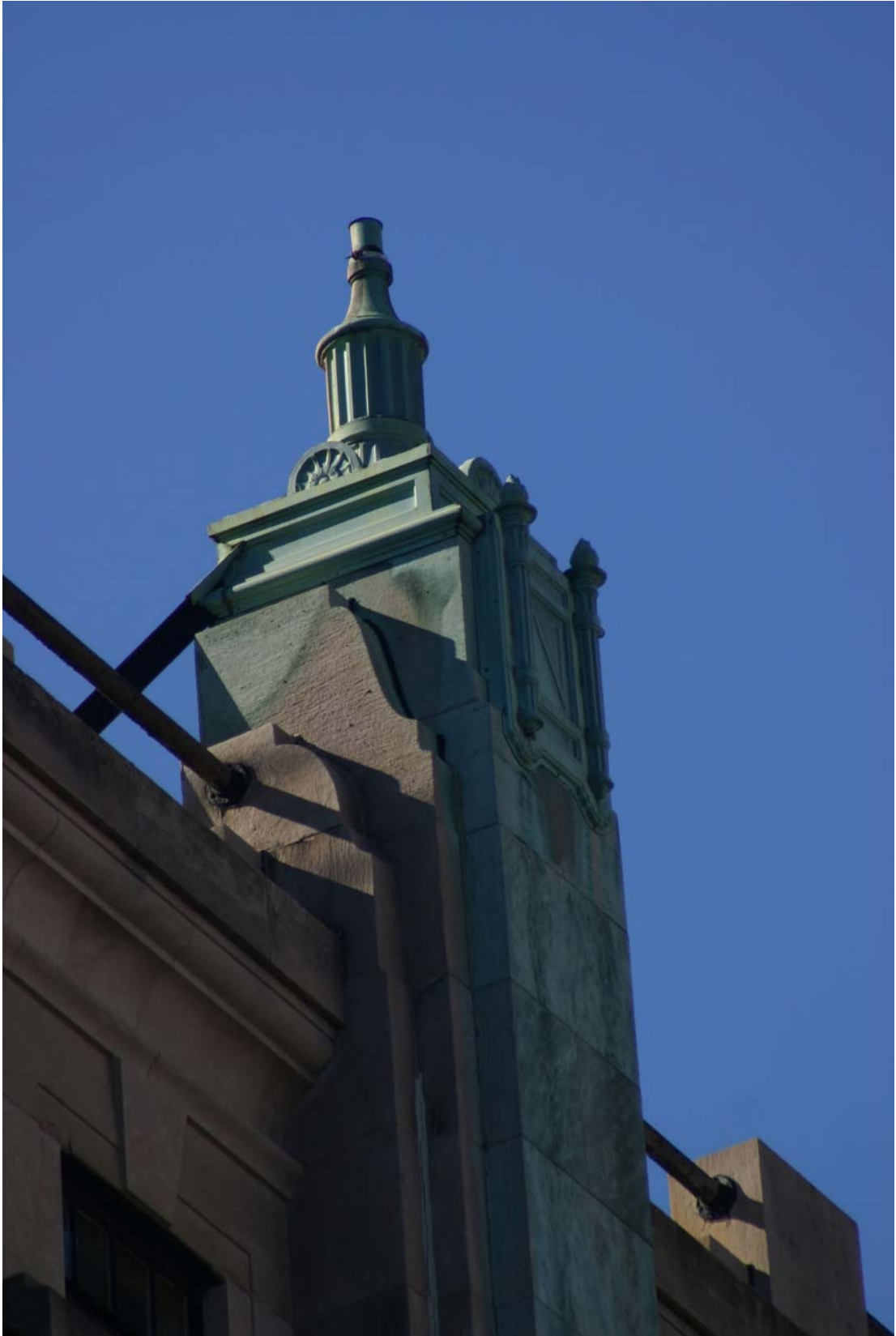
A. I. Namm & Son Department Store , bronze finial/flagpole holder