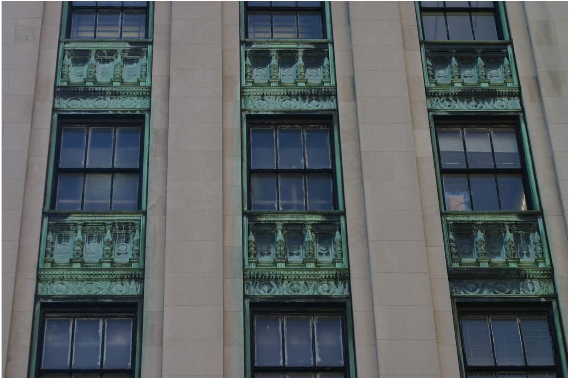
A. I. Namm & Son Department Store , mid-section detail