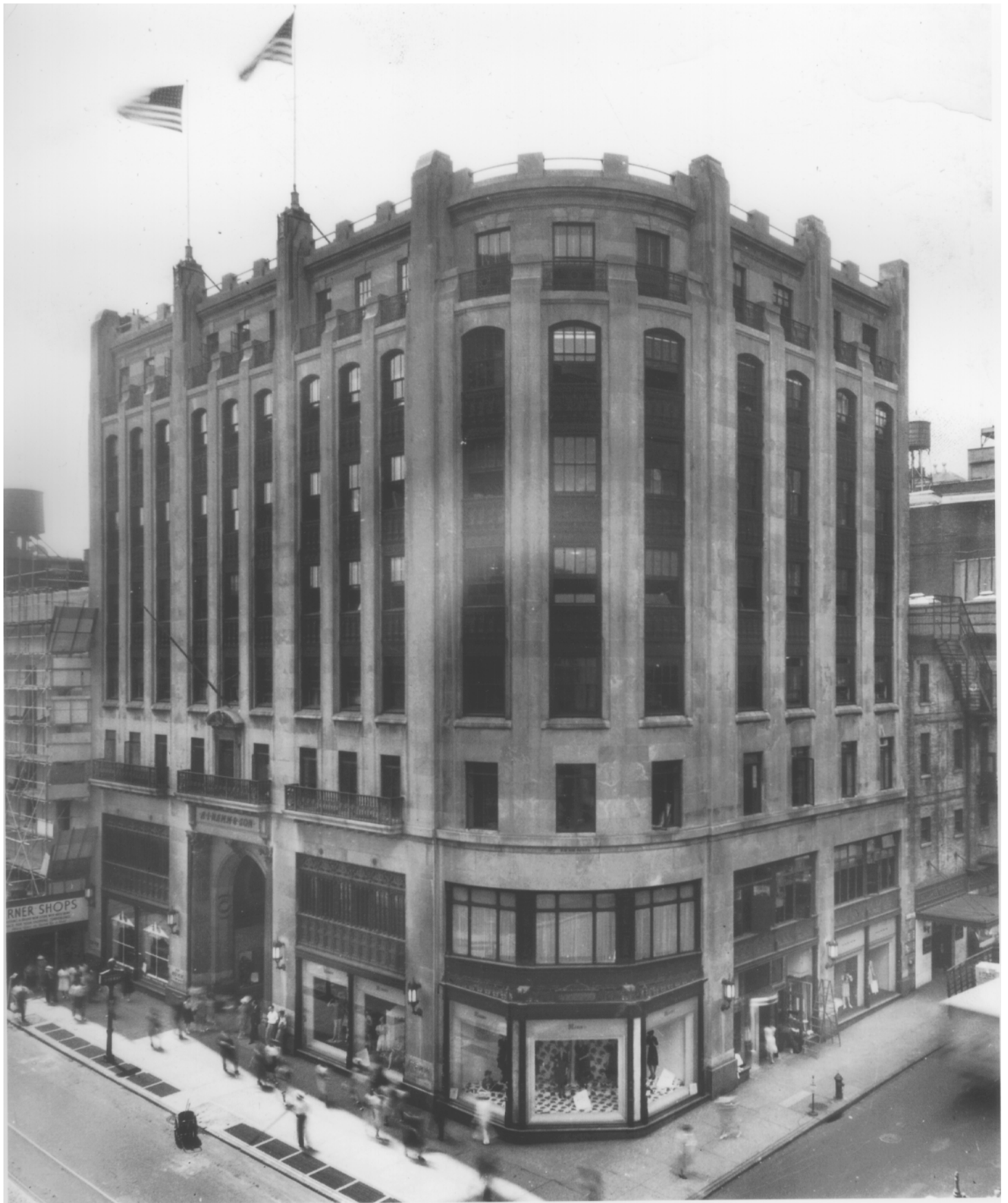
A.I. Namm & Son Department Store , historic photo (n.d.)