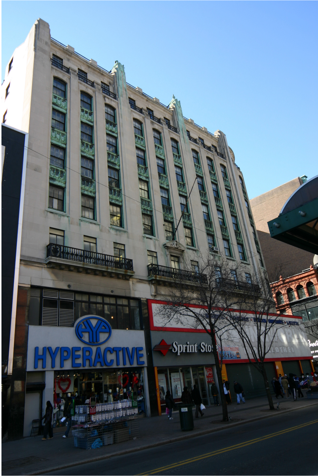
A. I. Namm & Son Department Store, 450-458 Fulton Street, Brooklyn