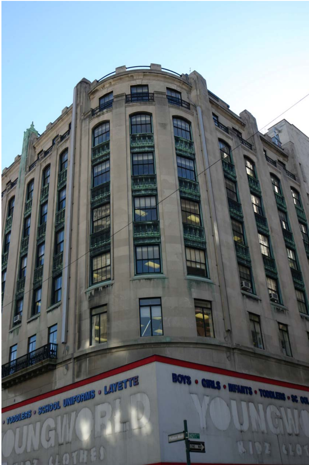
A. I. Namm & Son Department Store, 450-458 Fulton Street, Brooklyn