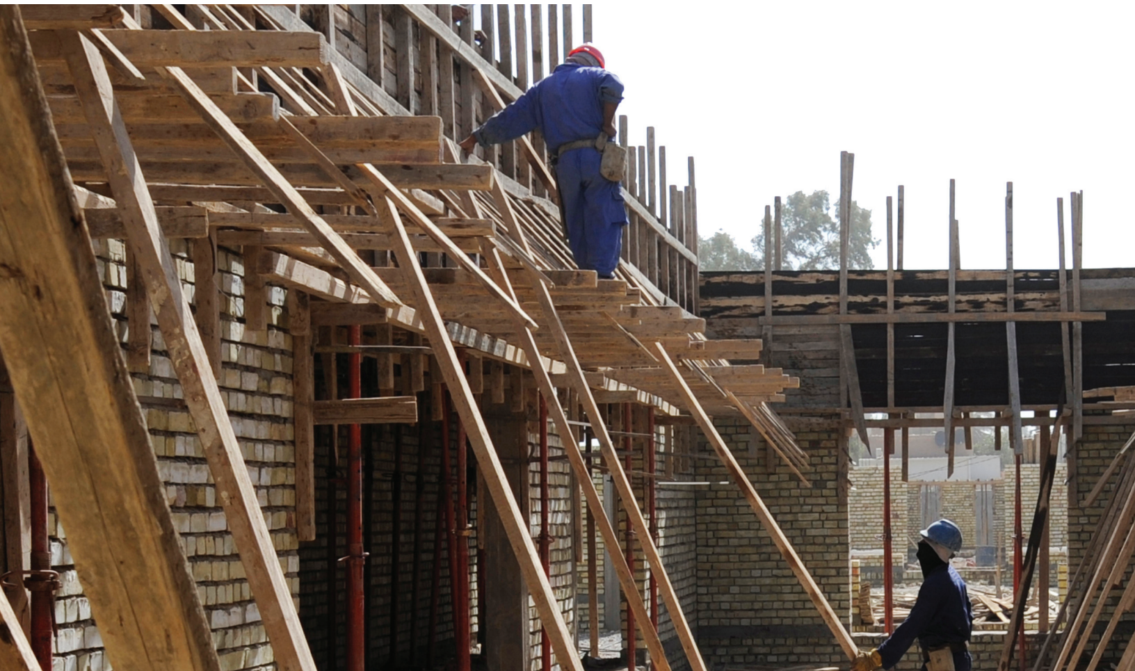
Iraqi contractors on school construction site, Baghdad, Iraq.