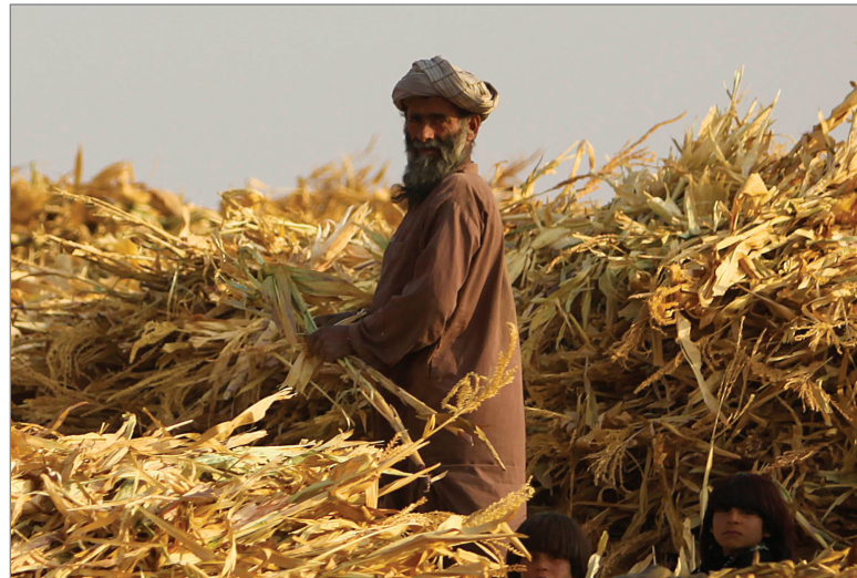
Afghan farmer, Helmand province, Afghanistan.

$360 million USAID agricultural development project —The Afghan Vouchers for Increased Production in Agriculture began as a modest $60 million initiative in 2009, distributing vouchers for wheat-seed and fertilizer to counteract drought-related food shortages in Afghanistan's north. Under pressure to inject $1 million each day into a dozen or so key terrain districts for seeds, fertilizer, tools, cash-for-work, and community development, USAID within a few weeks turned the initiative into a massive $360 million stabilization program in the south and east. The pressure to quickly spend the millions of dollars created an environment in which waste was rampant. Paying villagers for what they used to do voluntarily destroyed local initiatives and diverted project goods into Pakistan for resale. 3