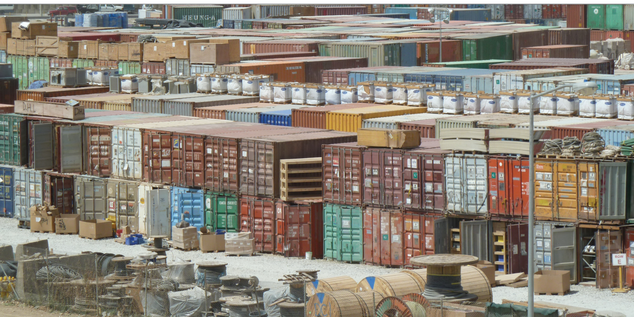
Shipping containers, Bagram Airfield, Afghanistan.

rate would indicate that between $10.3 billion and $18.5 billion of the $206 billion in funds spent for contingency contracts and grants has been lost to fraud. This estimate is consistent with the estimate of the Association of Certified Fraud Examiners, which has reported that 7 percent of commercial revenue is lost to fraud. 42