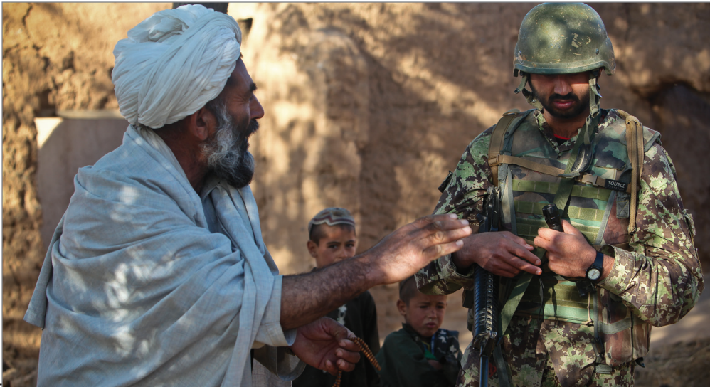
Afghan National Army soldier questioning villager.

$82 million Defense Afghan Defense University —Defense awarded a contract for about $82 million for the design and construction of Afghan Defense University, Afghanistan’s West Point. As the size of the ANSF tripled, the contract costs grew. 5 During an August 2010 Commission trip to Afghanistan, Defense officials said it would cost $40 million per year to operate and maintain—an amount possibly beyond the Afghan government’s ability to fund.