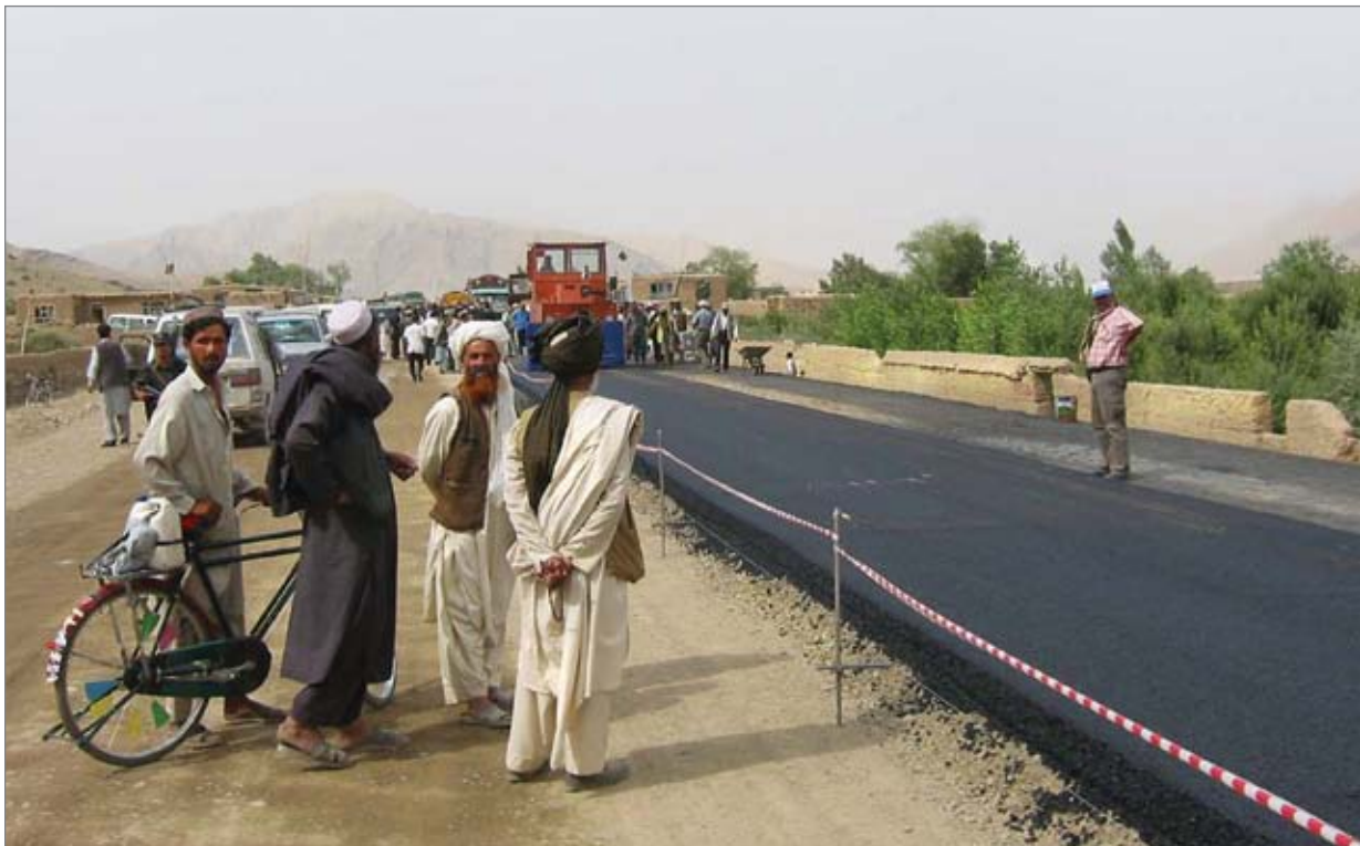
Kabul-to-Kandahar road construction, 2003.