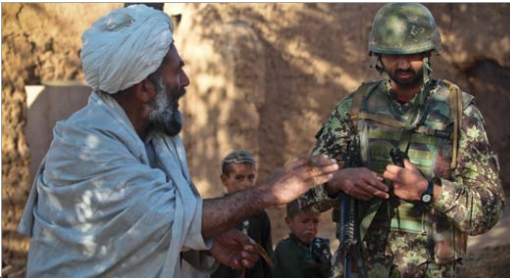
Afghan National Army soldier questioning villager.

$82 million Defense Afghan Defense University —Defense awarded a contract for about $82 million for the design and construction of Afghan Defense University, Afghanistan’s West Point. As the size of the ANSF tripled, the contract costs grew. 5 During an August 2010 Commission trip to Afghanistan, Defense officials said it would cost $40 million per year to operate and maintain—an amount possibly beyond the Afghan government’s ability to fund.