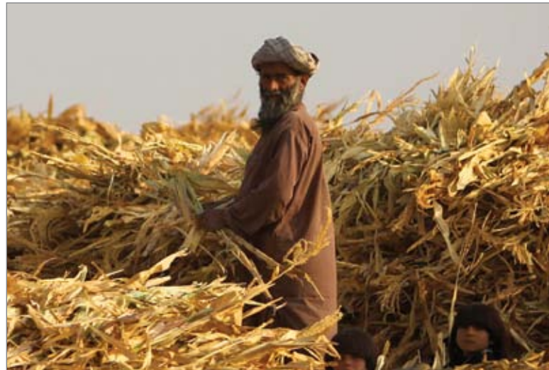
Afghan farmer, Helmand province, Afghanistan.

$360 million USAID agricultural development project —The Afghan Vouchers for Increased Production in Agriculture began as a modest $60 million initiative in 2009, distributing vouchers for wheat-seed and fertilizer to counteract drought-related food shortages in Afghanistan's north. Under pressure to inject $1 million each day into a dozen or so key terrain districts for seeds, fertilizer, tools, cash-for-work, and community development, USAID within a few weeks turned the initiative into a massive $360 million stabilization program in the south and east. The pressure to quickly spend the millions of dollars created an environment in which waste was rampant. Paying villagers for what they used to do voluntarily destroyed local initiatives and diverted project goods into Pakistan for resale. 3