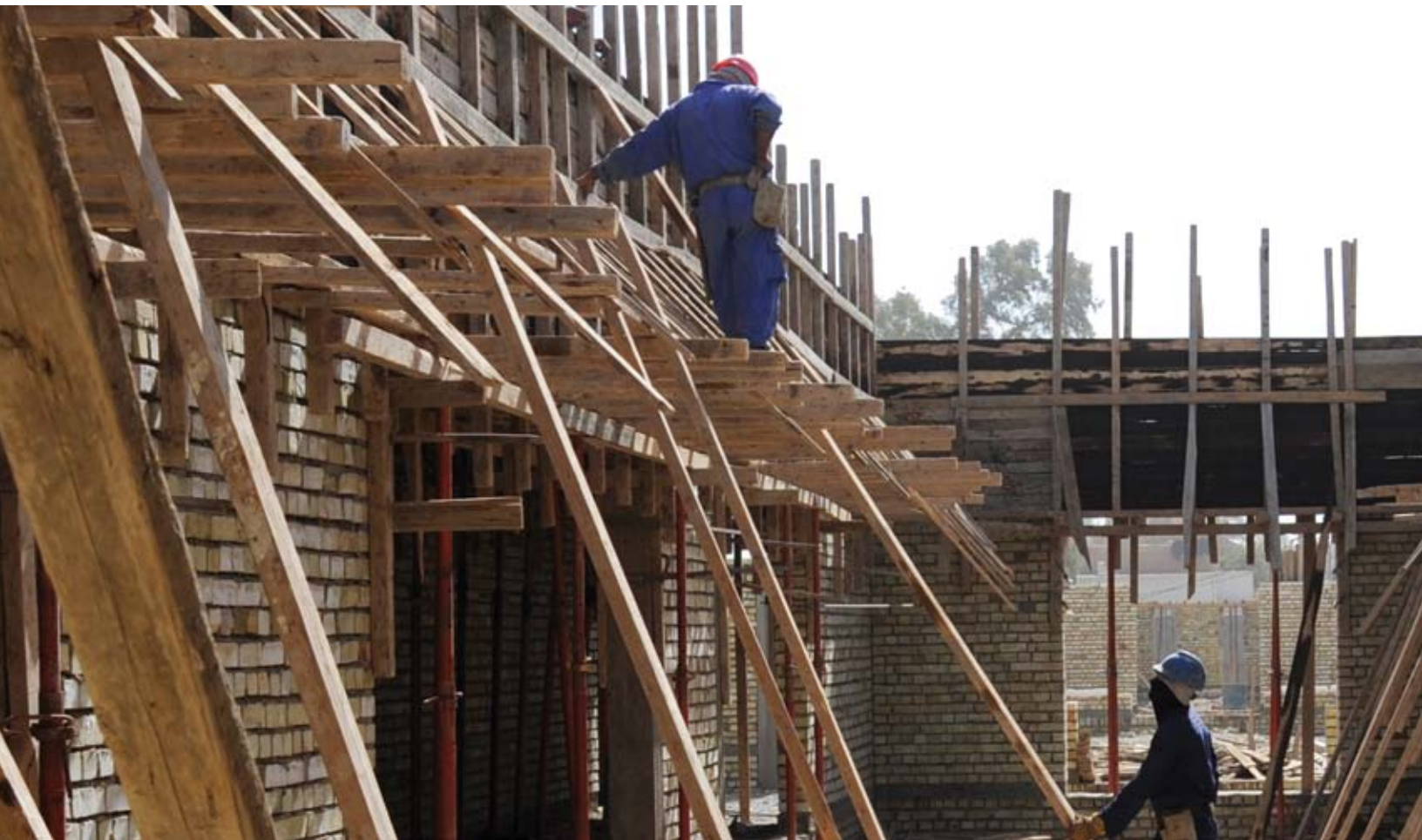
Iraqi contractors on school construction site, Baghdad, Iraq.