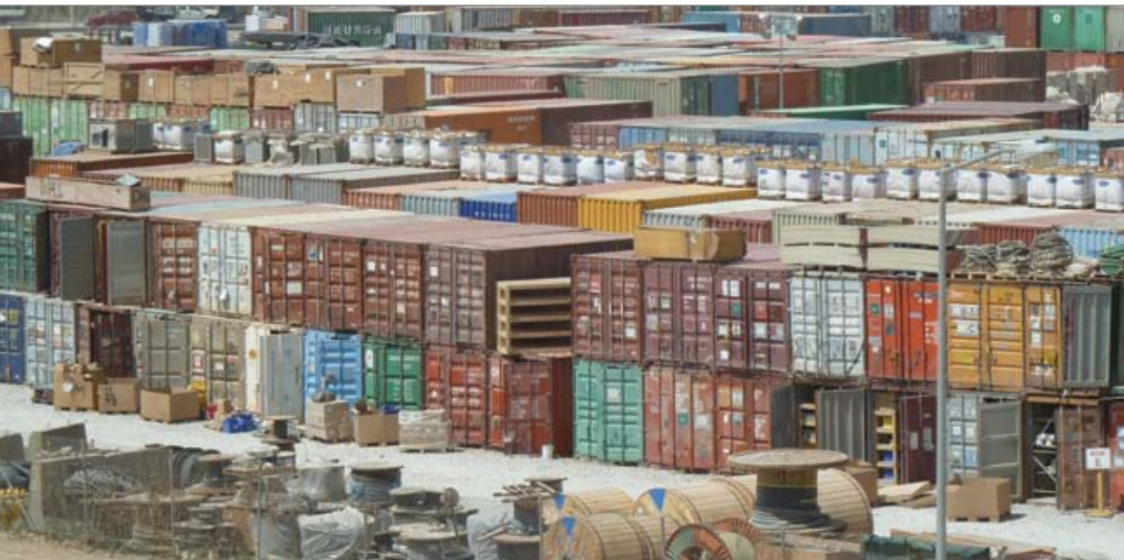
Shipping containers, Bagram Airfield, Afghanistan.

rate would indicate that between $10.3 billion and $18.5 billion of the $206 billion in funds spent for contingency contracts and grants has been lost to fraud. This estimate is consistent with the estimate of the Association of Certified Fraud Examiners, which has reported that 7 percent of commercial revenue is lost to fraud. 42