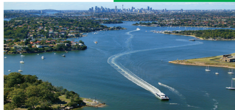
Parramatta River from Putney (Airview)