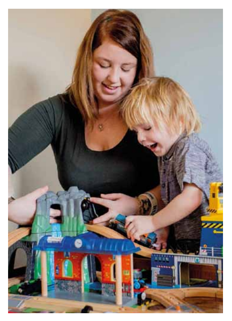
matter of priority, which would result in world-class educational benefits and reduce waste.

5. Adopt what is best in national policies in relation to changes in GCSE and A' Level, and adapt as appropriate to Northern Ireland, whilst ensuring students aren't disadvantaged when applying to mainland Universities.