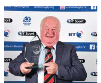
BT Volunteer of the Season