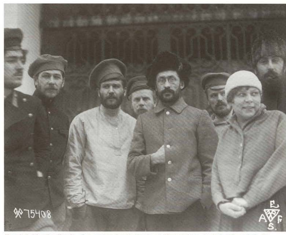
Tomsk Bolshevik officials, after capture by the Czechs at Ekaterinburg, included (from left) the town secretary, chief justice, town commissaire, and stenographer. They were soon executed.

accused soldier had not been violated. He recommended corrective action, if necessary. As no court-martial had legal effect until its judgment was approved by the commander who had convened the court, a judge advocate might suggest to this commander that part or all of the findings of guilty be disapproved, or that the sentence be modified in some manner. Consequently,