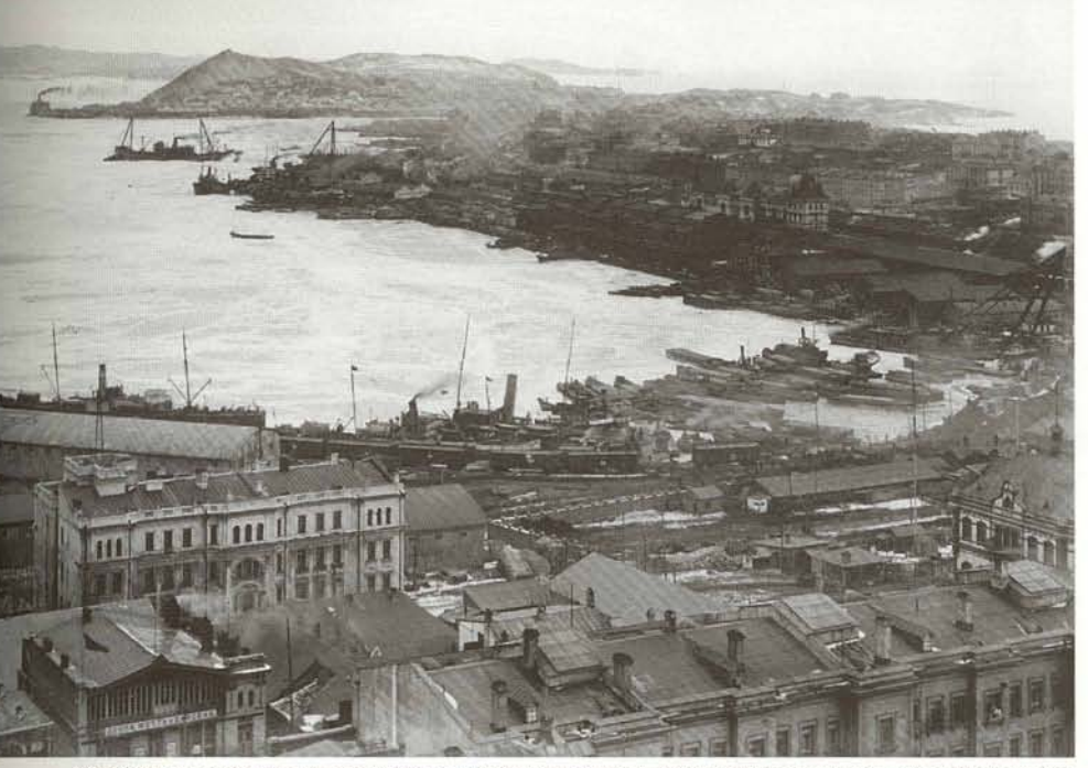
Vladivostok's extensive port facilities and Trans-Siberian Railroad terminus served as the base for Allied forces in Siberia, including the ten thousand American troops that served there until 1920.

ducting the trial, the proof necessary to convict a soldier of an offense, and the legality of considering certain testimony or evidence.