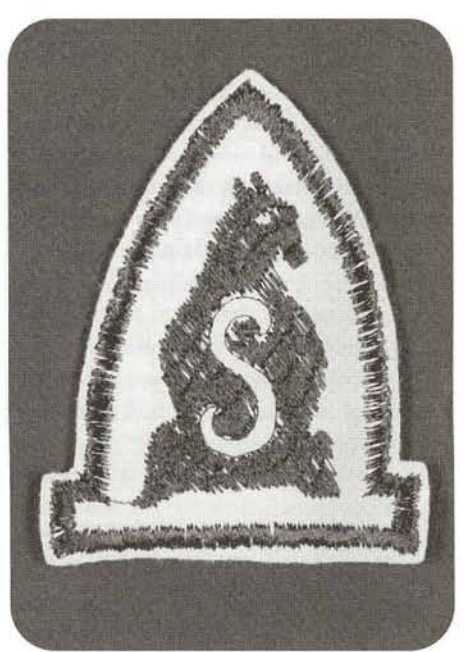
Soldiers of the Thirty-first Infantry Regiment adopted a shoulder patch featuring a black bear with an "S" (for Siberia), to distinguish themselves from AEF units in North Russia.