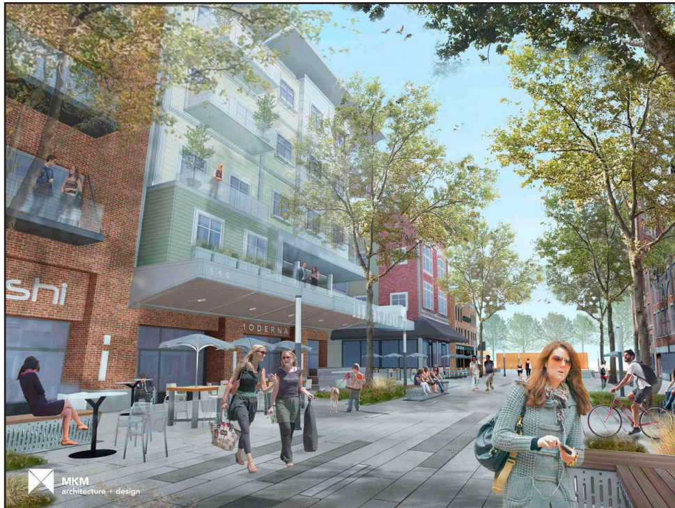
The $32 million redevelopment of the Columbia Street "Landing" will create 72 residential units and 22 storefronts that could accommodate coffee shops, bars, restaurants, offices and shops.

Dissenting were Paul Ensley, R-1st, and Jason Arp, R-4th who regularly oppose economic projects