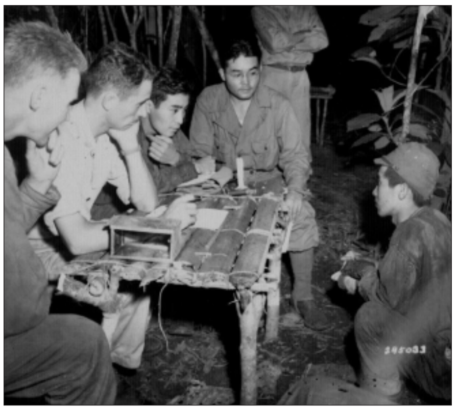
Nisei interpreters assisting with an interrogation during World War II.

the Nisei linguists may have viewed their opponents, the Japanese: