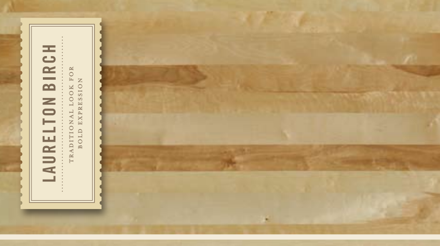
EACH PIECE OF VENEER IS UNIQUE AND EXHIBITS THE NATURAL CHARACTERISTICS OF ITS SPECIES; ACCORDINGLY, THE ACTUAL VENEER MAY NOT APPEAR EXACTLY LIKE THIS PRINTED REPRODUCTION.