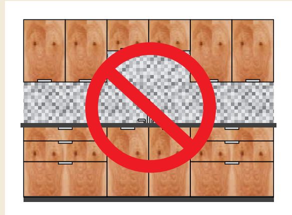
"Consistently Inconsistent" plank match for harmonious blending. Avoid the "machine gun" look and other undesirable repeats.