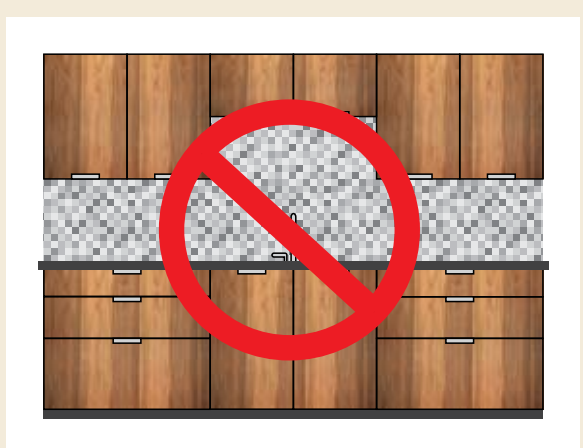
Manufacturing with tight side out construction ensures even finishing. Avoid the "barber pole" effect.

By buying products with an FSC label you are supporting