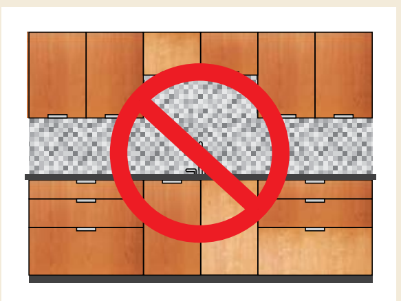
Sorted for visual uniformity and ease of matching and blending. Avoid mismatched cabinetry.