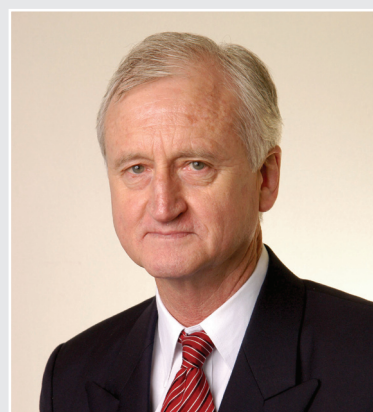
The Honourable Justice Reginald Blanch AM is the Chief Judge of the District Court and a Commission member.