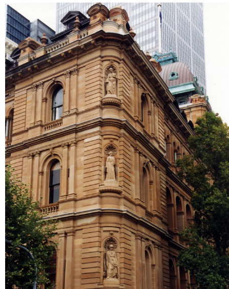
Chief Secretary's Building